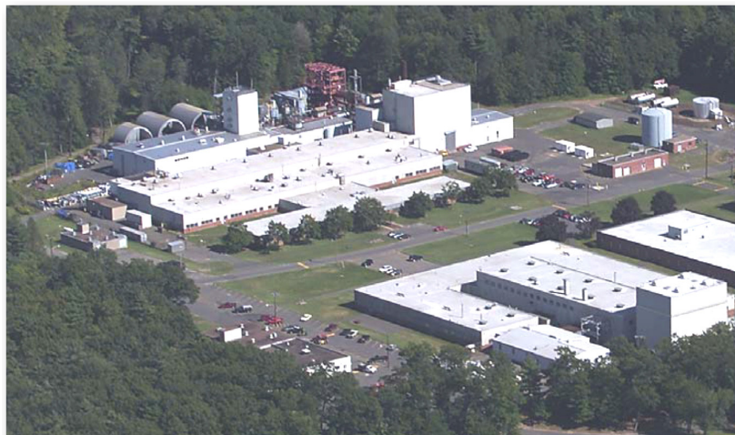
ALSTOM Power Plant Laboratories