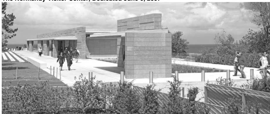
The Normandy Visitor Center, Dedicated June 6, 2007