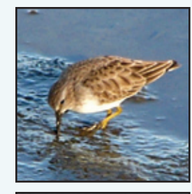
Least Sandpiper Salt & tidal water Fairly common fall-spring