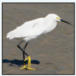
Snowy Egret Tidal & fresh water Fairly common spring-fall