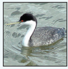
Western Grebe Open salt water Common fall-spring