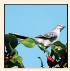
Mockingbird Scrub Common year-round