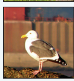
Western Gull Salt & fresh water Common year-round