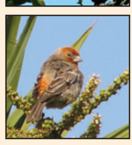
House Finch All terrestrial habitats Common year-round