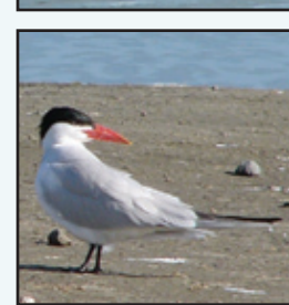
Caspian Tern Salt, tidal & fresh water Fairly common spring-fall