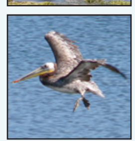
Brown Pelican Open salt water Common spring-fall