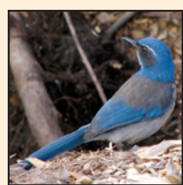
Scrub and willow Common year-round