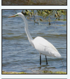
Great Egret Tidal & fresh water Fairly common vear-round