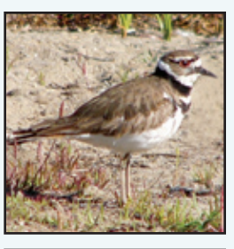
Killdeer Fresh water, grasslands Fairly common year-round