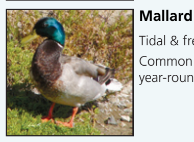
Tidal & fresh water Common year-round