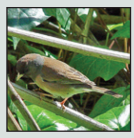
Willow, oak, scrub, grasslands Common year-round