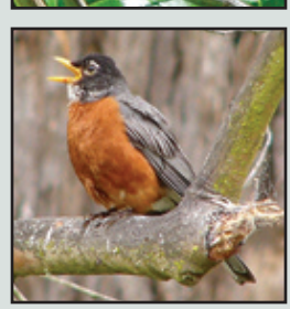
American Robin All terrestrial habitats Common year-round