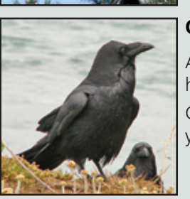
Common Raven All terrestrial habitats Common year-round