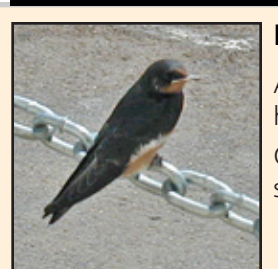
Barn Swallow All terrestrial habitats Common spring-fall