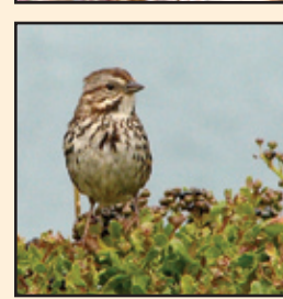
Song Sparrow Low dense scrub and willows Fairly common year-round