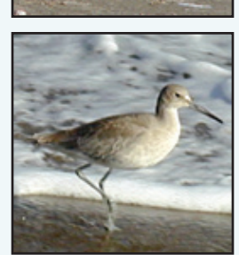
Willet Salt & tidal water Common fall-spring