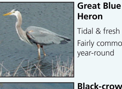
Heron Tidal & fresh water Fairly common year-round