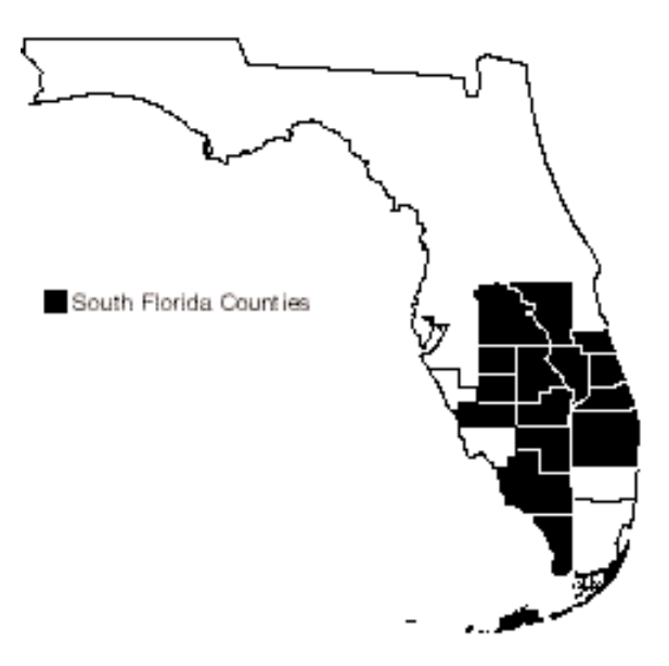
Figure 1. County distribution of Audubon's crested caracara.

udubon's crested caracara is a large, boldly patterned raptor, with a crest and unusually long legs. It is a resident, diurnal, and non-migratory species that occurs in Florida as well as the southwestern U.S. and Central America. In Florida, this species is found in the prairie area of the south-central region of the state. The subspecies is no longer present at its type locality, which is near St. Augustine, St. Johns County, Florida.