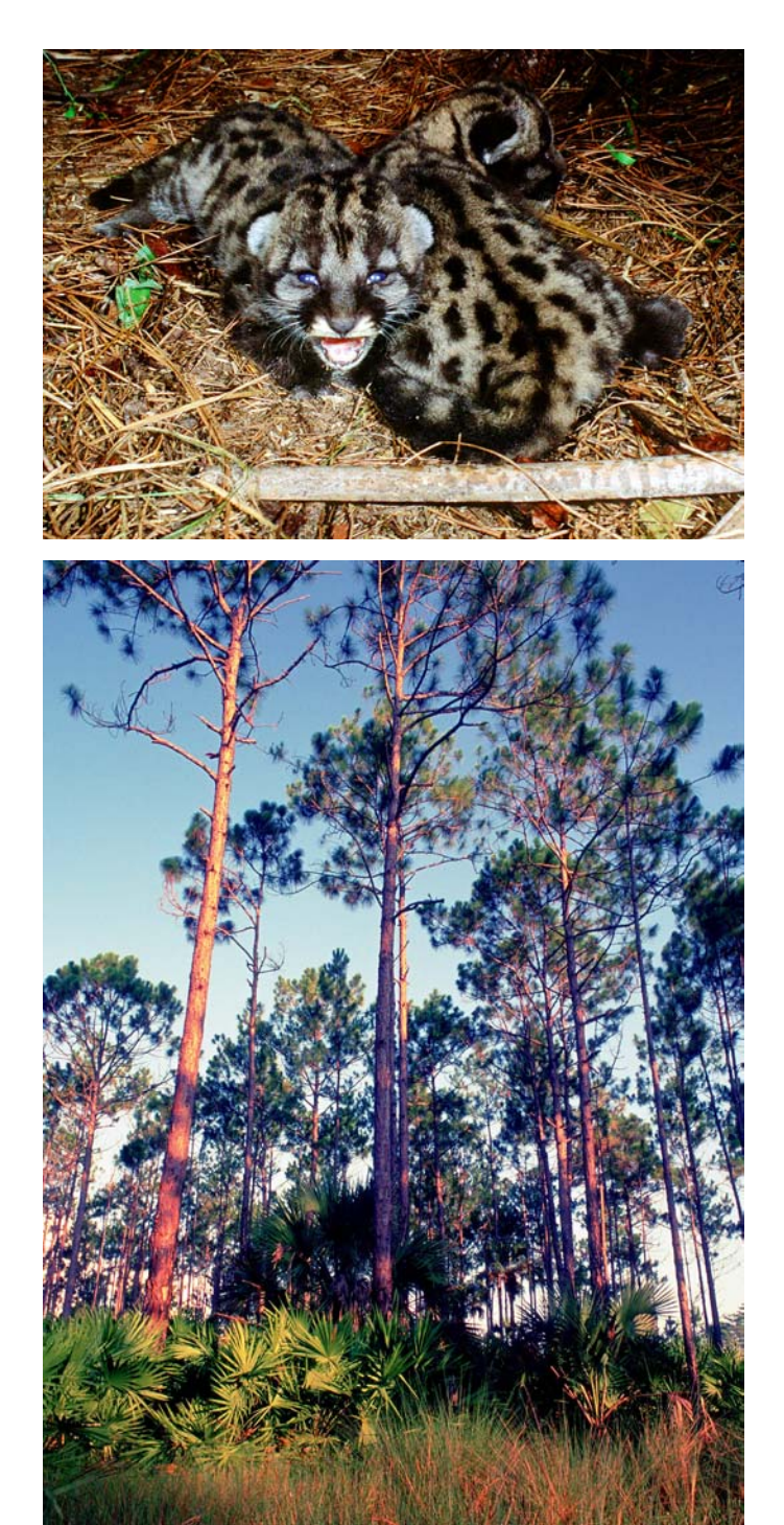
Top: less than two weeks old, these blue-eyed Florida panther kittens are completely dependent on their mother for every need, bottom: slash pine, Refuge's only pine species, towers over all other vegetation as the dominant upland habitat type.