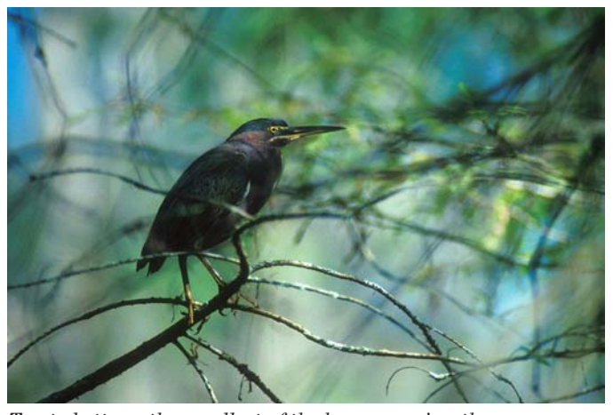
Top to bottom: the smallest of the heron species, the green heron often hides among the dense wetland vegetation, but can often be heard cackling when disturbed; with bright red legs and bill during the breeding season, a white ibis walks through the water picking up aquatic insects, frogs and small fish; common within ponds, water lilies share their affinity for sun alongside the American alligator.