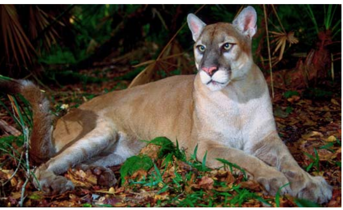
Florida panther, Puma concolor coryi, remains one of the most endangered mammals in the world.

Immediately prior to refuge establishment, the land was owned by the Collier family and was primarily used for private hunting leases and cattle grazing. A few home sites and hunting camps were located on the land. In 1989, the Service purchased the initial 24,300 acres from the Collier family for $10.3 million dollars. In 1996, the refuge was expanded to 26,400 acres with the addition of more Collier family land through the Arizona-Florida Land Exchange Act of 1988.