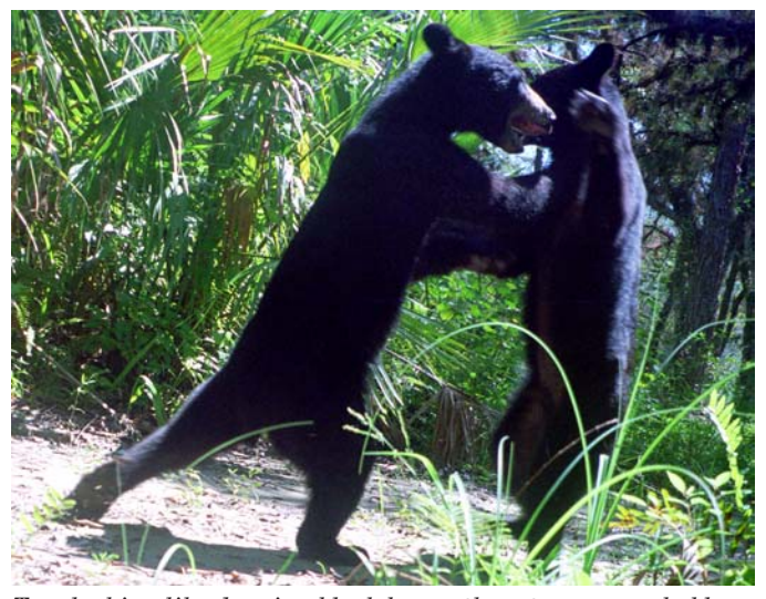
Top: looking like dancing black bears, these two are probably juveniles sparring with each other until the day when they become serious about territories; below: a glossy ibis walks the shallows of a swamp probing for food; bottom: a great egret, in breeding plumage, stands majestically between feedings of small fish.