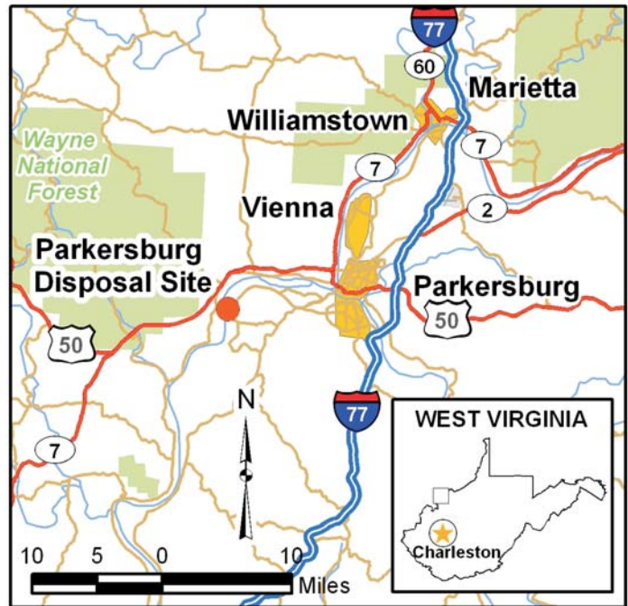
Location of the Parkersburg, West Virginia, Site

AMAX ceased production in 1974 and began conducting laboratory-scale experiments on baddeleyite ore, an oxide of zirconium. In 1977, AMAX sold the property to L.B. Foster Company, a manufacturer of steel pipe. The U.S. Nuclear Regulatory Commission (NRC) conducted site inspections in September and October 1977 and found areas of residual soil contamination. The ensuing cleanup program produced 70 drums of contaminated soil, which were shipped off site to an NRC-approved disposal site. During building construction activities by L.B. Foster Company in 1978, a backhoe excavation uncovered pyrophoric waste materials that caused several fires and explosions. AMAX subsequently repurchased the property from L.B. Foster and began radiological, geological, and hydrological characterization to evaluate the site for cleanup.