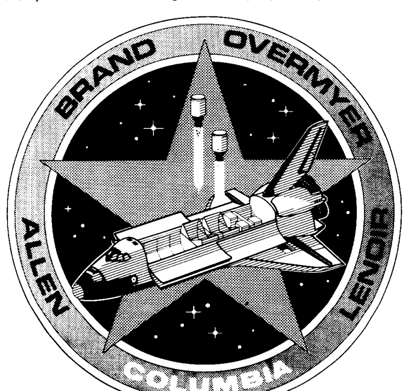
This is the official mission patch for the upcoming STS-5 flight, now scheduled for November launch. The five points of the star signify the mission number, and the two satellites blasting off from the cargo bay represent Telesat E and SBS-C, the first spacecraft to be orbited from the Space Shuttle. The patch is predominantly light blue, dark blue, red and yellow.

et Austin may come from an enormous cloud of comets, a comet storage space, in effect, that surrounds the Solar System and in which comets orbit the sun at very large distances, possibly one third the distance to the nearest star, Alpha Centauri. Alpha Centauri is about four light years from the earth. A'Hearn said Comet Austin may have been disturbed slightly by the interaction of a neighboring star, slightly changing its orbit so that it was pulled by the sun's gravity into the inner Solar System.