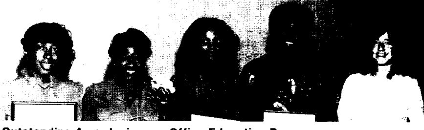
Outstanding Award winners, Office Education Program