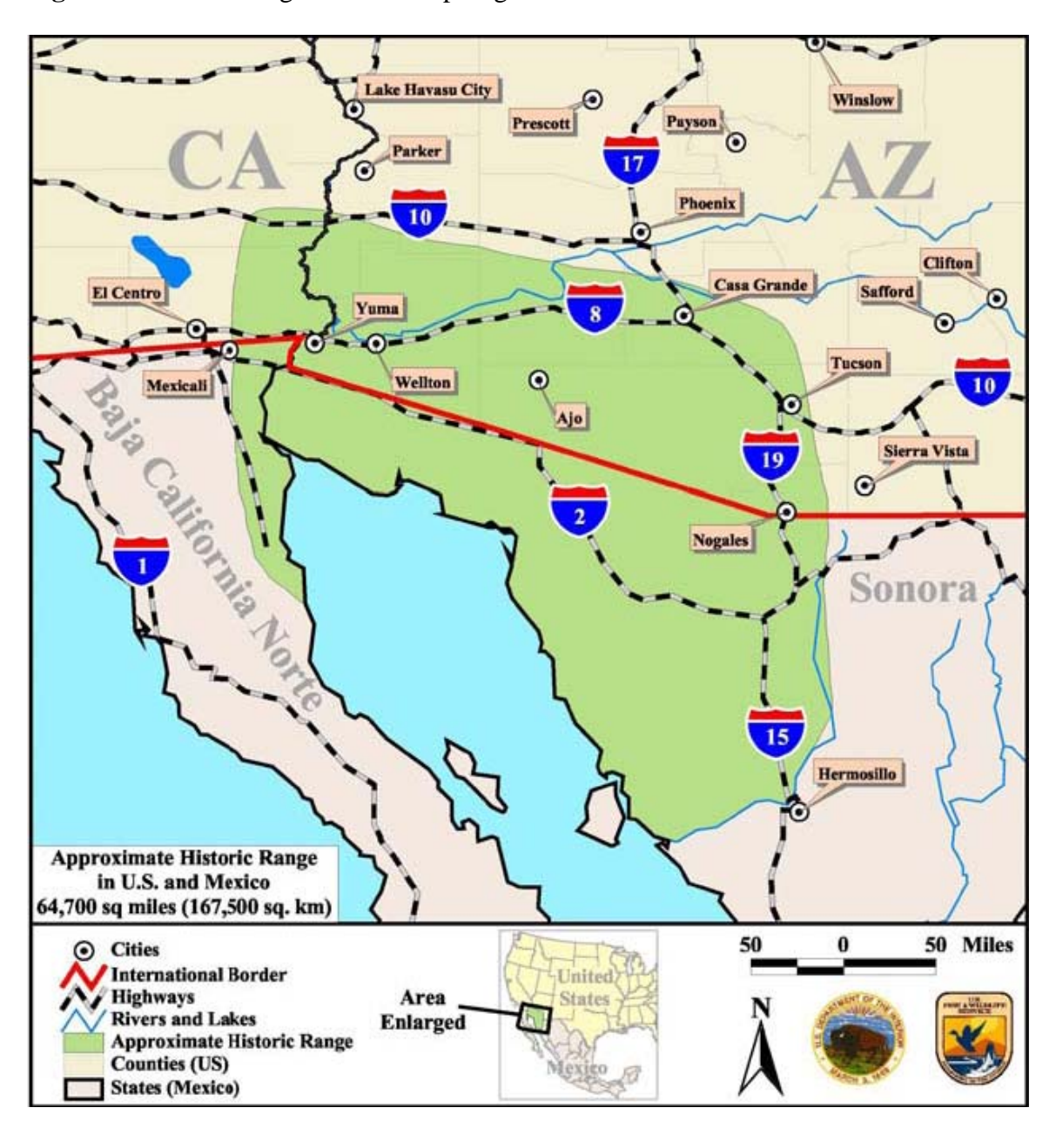
Figure 2. Historic range of Sonoran pronghorn in the Unites States and Mexico.