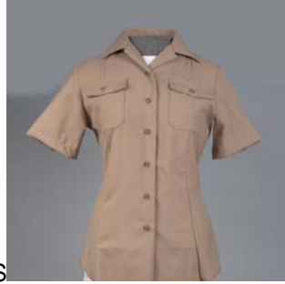
SHIRT, KHAKE, SHORT SLEEVES