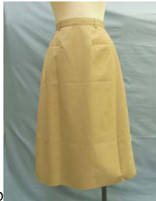
SKIRT, KHAKE SERVICE, BELTED