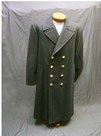
OVERCOAT, BLUE (BRIDGE COAT)