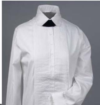
SHIRT, WHITE FORMAL