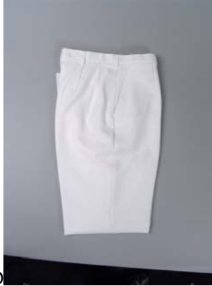
SLACKS, WHITE, SUMMER, BELTED