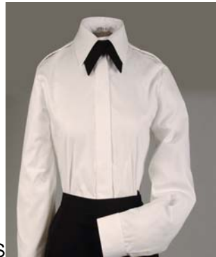
SHIRT, WHITE DRESS