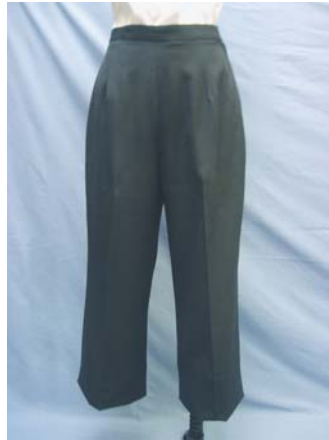
SLACKS, BLUE, UNBELTED