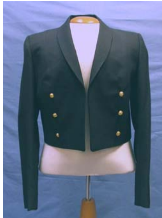
JACKET, DINNER DRESS BLUE