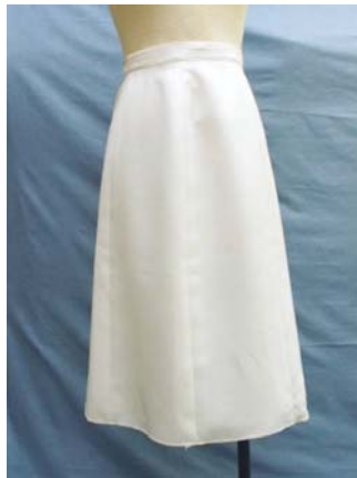
SKIRT, WHITE, UNBELTED