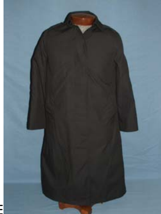
ALL WEATHER COAT, BLUE

NOTE: The item references are alphabetically listed following the illustrations.