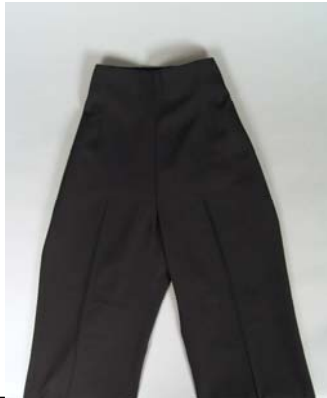
SLACKS, BLUE, FORMAL