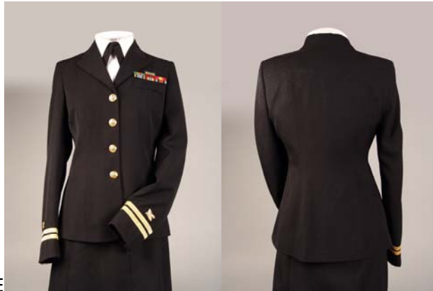
COAT, SERVICE DRESS BLUE