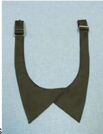
NECKTIE, BLACK DRESS