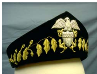
TIARA (Phase Out 1 August 2009)

(NOTE: This photo is the US Navy tiara, NOT the Corps version)