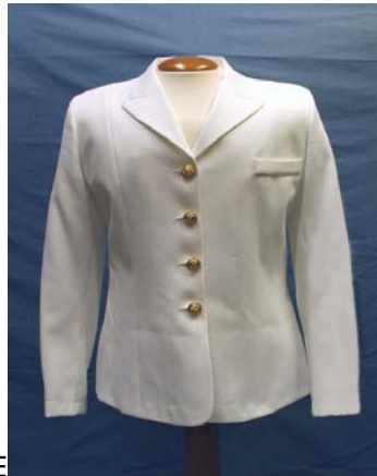
COAT, SERVICE DRESS WHITE