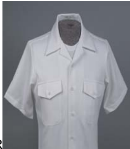
SHIRT, WHITE, SUMMER