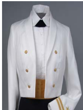
JACKET, DINNER DRESS WHITE