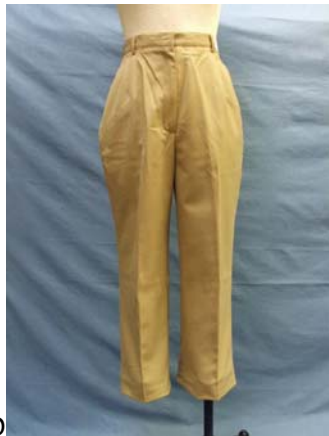
SLACKS, KHAKI SERVICE, BELTED