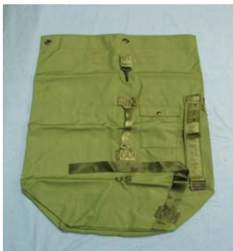
DUFFEL BAG, G.I.