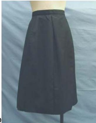
SKIRT, BLUE, UNBELTED