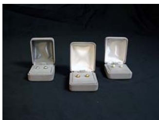
EARRINGS, BALL, GOLD, PEARL

(NOTE: Pearl Earrings Phase Out 1 August 2009)