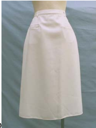
SKIRT, WHITE, BELTED