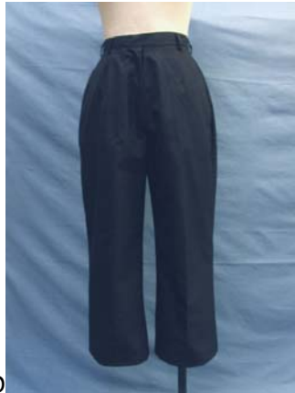
SLACKS, BLUE, BELTED