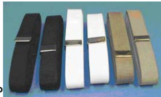
BELT, WITH GOLD CLIP