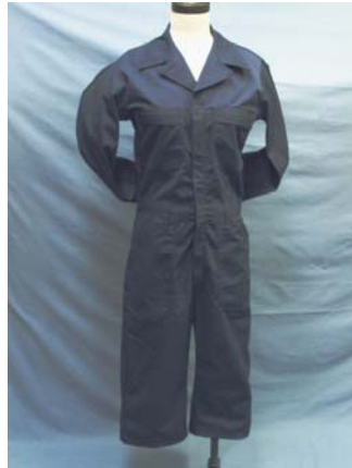
COVERALLS - NAVY