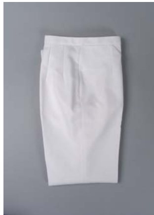
SLACKS, WHITE, UNBELTED