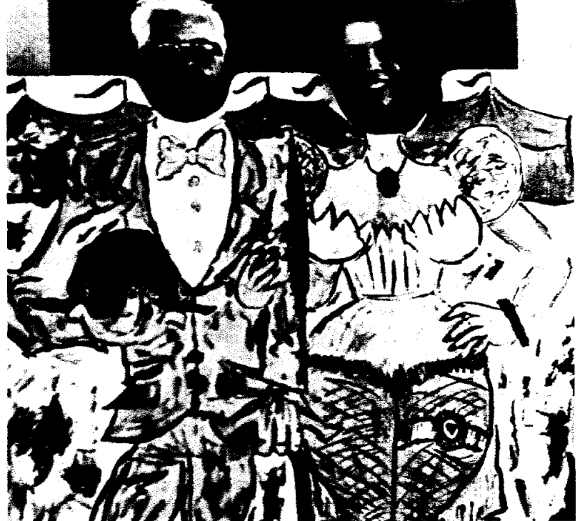
THIS IS THE TYPE OF backdrop which the EAA picnic committee has constructed for photographic "gag" shots at the picnic in September. Bring your friends and camera!