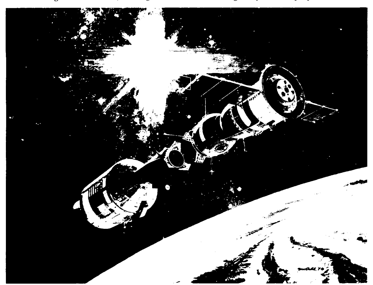
AN ARTISTS CONCEPT illustrating an Apollo spacecraft about to dock with a Soviet Soyuz venicle in earth-orbit. The miss scheduled for July 1975, is designed to test equipment and techniques which will establish international crew rescue capability in space. Each nation is developing separately docking systems based on a mutually agreeable single set of interface design specifications. Artist for this concept is Robert McCall, longtime associate of the space program.