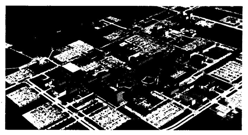
THIS IS A 1972 AERIAL View of the Johnson Space Center. Results of the careful landscaping given the site are evident even from this altitude. The knolls surrounding the duck ponds are particularly attractive in the fall and spring when the ducks make ample use of this "free sanctuary."

Well for your information, emhow much work is involved in the ployees, it's all because of "Speedy" -- Speedy Maintenance