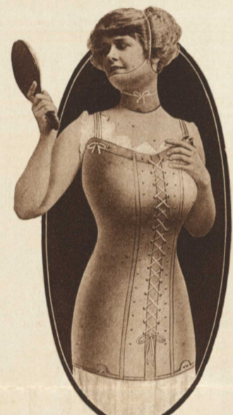
Fig. 1—Corset. Reduces bust, hips and thighs. Can be worn comfortably under a corset. Price $30.00.

HARDMAN, PECK & CO., 433 Fifth Ave., N. Y. 524 Fulton St., Brooklyn.