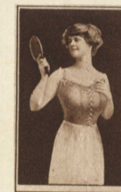
Fig. 3—Eton Jacket. Price $12.00.