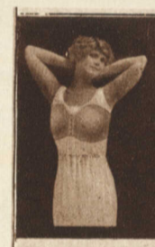
Fig. 4—Bust Reducer. Price $5.00.