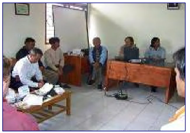
BAPENAS, USAID, and ASGITA discuss future strategies