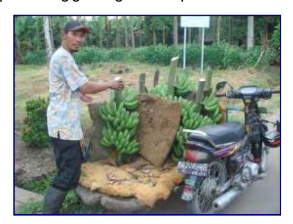
Harvesting and transporting bananas in Biru-biru