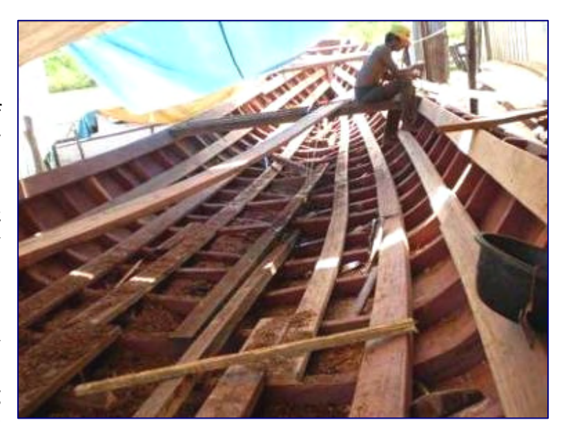
Ongoing construction of the seven meter boat for Agimuga

other boats usually take less than four hours. The longer trip will affect the quality of the fish delivered. Up to now the delivery of fish has been conducted by a longboat belonging to the Kokonao Catholic Parish. The provision of this boat has solved a major impediment to regular and reliable delivery of fresh fish to the Timika market. creating more demand for this high value fish. addition, PADA is utilizing a local boat builder to