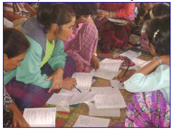
Female farmers discuss citrus practices during training

A total of 15 villages received follow-up training at the citrus field schools in Barus Jahe, Tiga Panah, Berastagi, Kabanjahe, and Munthe with a total of 464 male farmers and 174 female farmers participating. As a result of the ongoing technical assistance, AMARTA's evaluation determined field production increased 9.5 tons per ha and increased farmer's income by an average of Rp 28.5 million per ha, or Rp 3,000 per kg. In addition, collaboration between FGs has helped establish seven new branches of the Indonesian Citrus Society and Bukit Maju Bersama Citrus Cooperative,. The new cooperative is developing capacity to facilitate the sale of high quality production supplies, while also providing consulting services to farmers on good agriculture practices, such as: Managing soil, controlling pest and diseases, and preparing organic fertilizer. The cooperative anticipates earning between Rp 1-3 million per day in revenue. AMARTA and KSU MJI are in the process of securing a loan from Bank Mandiri in Medan to increase working capital for distribution to cooperative branches in each village where it is active.