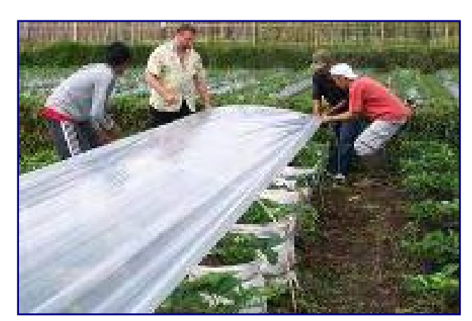
Covering strawberry plants