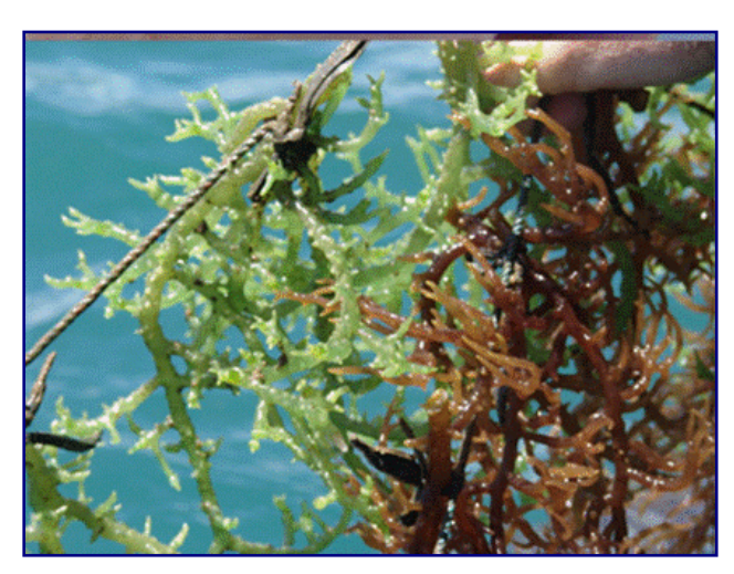
The green Kulit buaya shown next to the brown Tambalang variety

In April 2008, AMARTA and SEAPlant staff discovered a new variety of seaweed growing in Kwandang Bay. AMARTA Since then, has been conducting research on this variety, documenting its growth rate suitability as a source of kappa carrageenan. The new variety, which farmers call "kulit buaya" or crocodile skin, could have national application as an alternative to the Tambalang variety, which was imported from the Philippines in the 1980s. To date, the research has shown that the kulit buaya has a similar growth rate and carrageenan content to Tambalang.