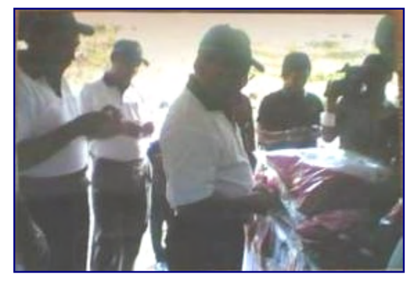
Dr. Anton Apriantono, Minister of Agriculture, visits ASGITA's display

agriculture product exhibition in Bandung December 1 st - 4<sup>th</sup>. from Dr. Apriantono, Indonesian Minister of Agriculture, visited the ASGITA display and requested that the excellent quality of the "Red-Ripe" Strawberry program expand and consider adding processed strawberries. Similar appreciation came Mr. Achmad Heryawan, from Governor of West Java, when he visited ASGITA's stand as mentioned in Tribun Jabar Daily Newspaper on December 3<sup>rd</sup>.