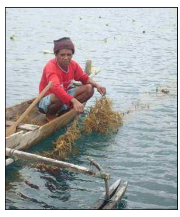
A farmer removing silt from his crop

AMARTA and SEAPlant staff are now working with 39 FGs - 15 in Kwandang, 14 in Anggrek (near Kwandang) and 10 in The 390 farmers in these Pohuwato. groups sold a total of 83 tons of seaweed during the reporting period, worth approximately $83,000. Sales would have been higher; however farmers in both areas are reinvesting for the future by replanting a significant portion of their harvest. This will increase production in coming months. About two thirds of the harvest will be processed for domestic markets, with the remaining one third bound for the export markets. A total of 142 farmers received training over the past three months on a variety of subjects, including: