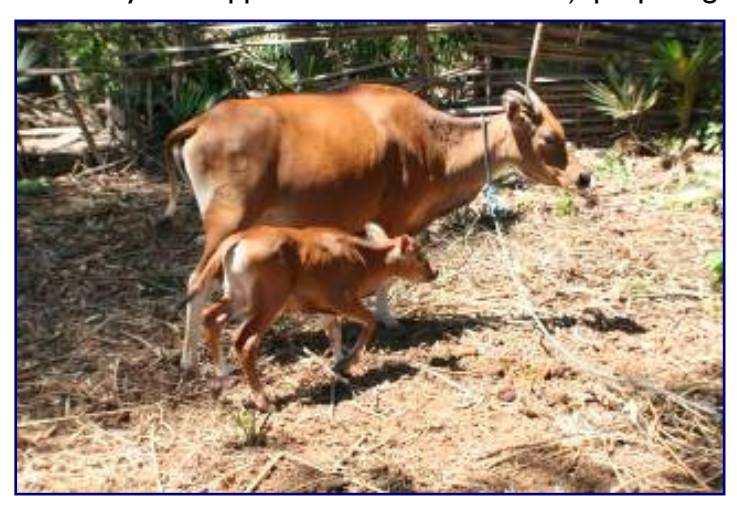
A mother and new calf in Kupang, West Timor

additional food for the dry season when very little food available, is improving the water supply for heifers and calvesincluding the possibility of constructing a water pipe scheme, 4) organizing a field day for farmers and government agencies to replicate the project, and 5) developing a breeding center with cows and bulls that have proven genetic records.