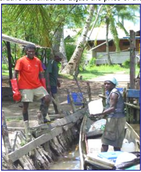
Fishermen selling fish and buying ice at the ice factory in Kokonao

ice, as well as the price of fish in Timika in an effort to break even on all costs associated with the facility. Currently, the cooperative purchase and stores an average of one ton of fish per week before making shipments to customers in Timika, including regular buyers PT. Pangansari and the Timika Community Hospital. Fortunately, the price of fish in Kokonao experienced a 20% increase form previous prices as the price of Baramundi fish rose from Rp 10,000 to Rp 12,000 per kg, while the price for mixed fish, other than Baramundi, rose from Rp 8,000 per kg to Rp 10,000 per kg. In October, the Cooperative spent Rp 34,734,500 ($3,150) to purchase fish from local fishermen in Kokonao and the surrounding villages, providing substantial income for the fishermen and their families.