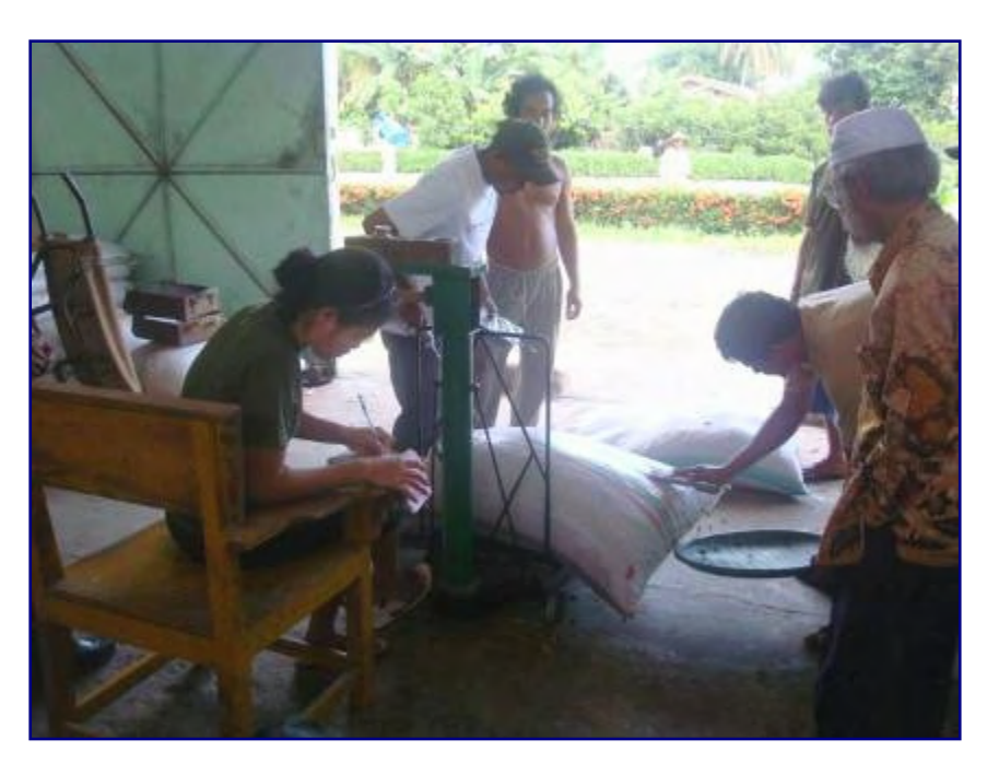
Farmers selling cocoa to an exporter