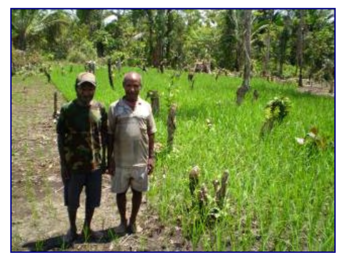
Rice patties coming into bloom

the building for the rice processing unit was completed this quarter and a test run of the rice processing unit was conducted successfully. Rice planting continued and additional farmers have joined the initiative as five new plots have been cleared for rice planting in Aramsolki Village. A medium sized, four-wheel drive John Deere farm tractor was purchased by AMARTA and was delivered to Timika. Construction of a trailer to move the tractor is ongoing and will enable final transportation Agimuga.