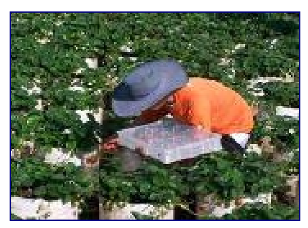
"Red Ripe" strawberry harvest