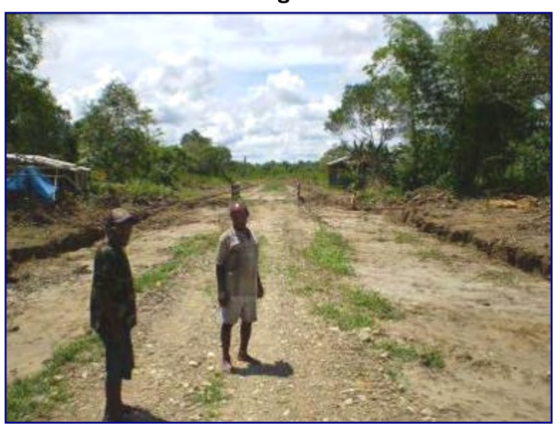
The reconditioned supply road between Aramsolki and Kiliarma

During the quarter, the reconditioning of the 12km road between supply Aramsolki and Kiliarma was completed. Currently, there is a government project taking place to improve and pave the road and to widen it from 2m to AMARTA 5m. will coordinate with government officials regarding this project. The two km extension road from the main route to the pig pen was also completed and construction of two new bridges continues to