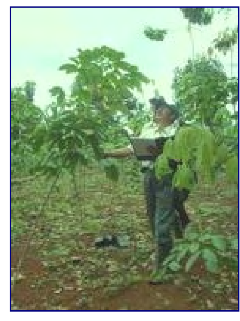
IRRI Getas at the Sutijab budwood garden

Between November 18th-24th, AMARTA's clonal nursery rubber component, in collaboration with the Indonesian Rubber Research Institute (IRRI) Getas, facilitated clonal purification of 1.55 hectares including 10,128 rubber trees in smallholder nurseries at Bentok Darat, Kait-kait Lama, Kait-kait Baru and Martadah Villages, South AMARTA, Bridgestone, and the Kalimantan. provincial estate crops agencies have been working together on this pilot project to help smallholders develop rubber nursery businesses that will provide high quality clonal materials in the market, for which there is high demand, but ongoing uncertainty regarding the quality of Clonal purification is the most materials. important activity in order to certify that the bud eyes produced are pure per the clone labeling.