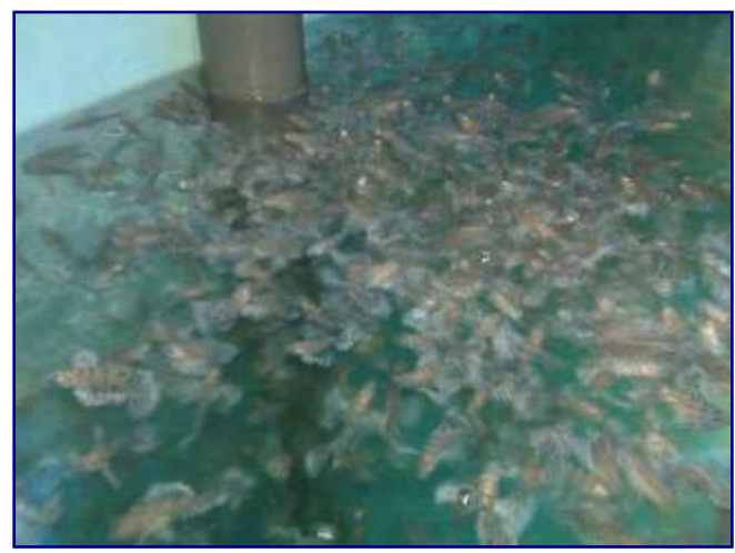
Part of the 20,000 6cm fingerlings produced