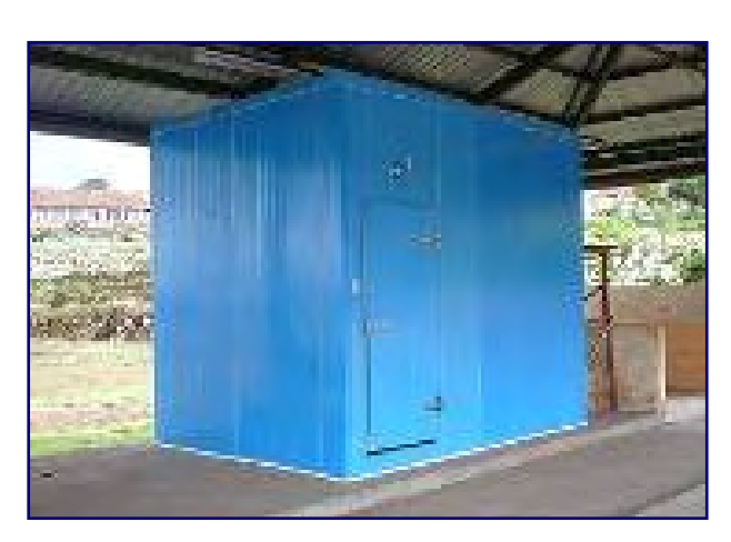
ASGITA cold storage facility

The strawberry program received enthusiastic support from the Bandung Local Government, including the Regional Agricultural Service. Padjajaran University, using funding from the regency, has provided business training and cooperative management to growers. The Bandung local government also provided cold storage resources worth Rp 130 million, plus an additional Rp 120 million in support totaling Rp 250 million. The LPM-UNPAD (Lembaga Pengabdian Masyarakat-Universitas Padjadjaran or Social Service Institute of Padjadjaran University) also contributed around Rp 50 million for the ASGITA institutional development training program. AMARTA is also working with these partners on ensuring the project is sustainable.