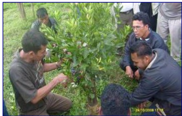
TOT participants in the class and in the field

"Thank you USAID and AMARTA for revitalizing my citrus trees and my life. I feel more confident in myself and can finally buy food and clothing that my family needed."