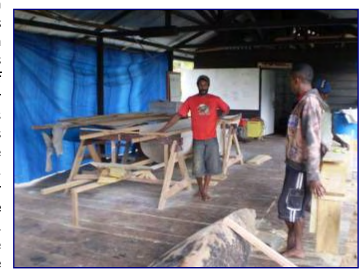
Building fiberglass molds

participants was completed in June 2008. Fifteen participants considered trained fiberglass handling procedures and partially in the concept of building molds for different fiber articles. The mold for small boats is completed and three boats have been produced by the training participants. Furthermore, holding tanks for fish in the cool storage area have been produced by the trainees. The mold construction for the large wooden boat will continue next quarter.