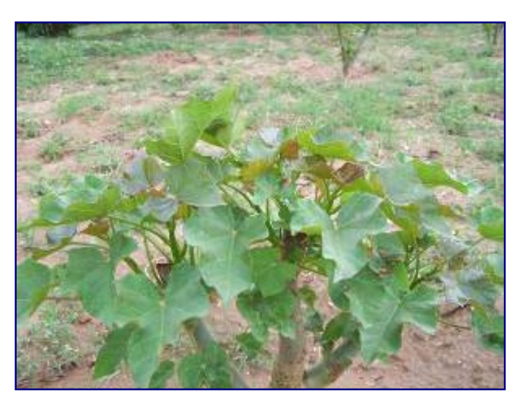
A jatropha plant after pruning, showing re-growth of branches

In Legu, the first harvest is expected in February 2009; this will coincide with the harvest from the existing hedges and wild plants in the area. In Uluwae, the first harvest will be limited, due to the small size of the plants. The farmer's group in Uluwae is making arrangements to purchase