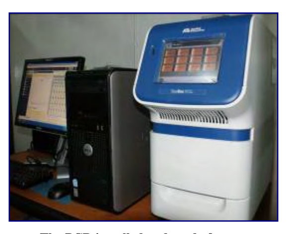
The PCR installed and ready for use

During the quarter, AMARTA worked with grantee PT Aceh Windu Lestari on completing and operating the testing laboratory. All of the equipment, including: the PCR system, auto clave, microscope, oven, and incubator were installed, while chemicals and glassware were also provided. The two key staff and their assistants responsible for operating the laboratory commercially were trained by the vendor on using the equipment properly, and also trained AMARTA's by aquaculture consultant on selecting appropriate samples, tests, and analysis.