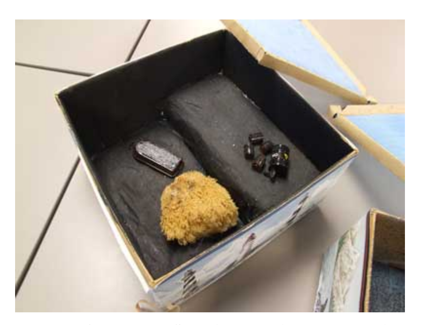
Example of Handmade Sounding Box without the aluminum foil