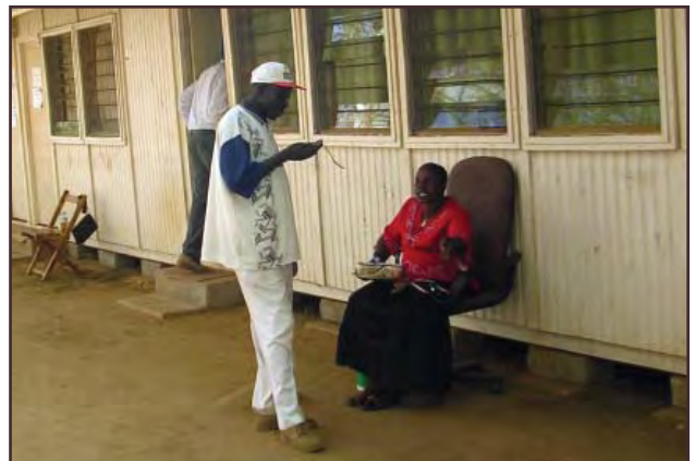
Ministry of Health

The Capacity Project, funded by the United States Agency for International Development (USAID) and implemented by IntraHealth International and partners, helps developing countries strengthen human resources for health to better respond to the challenges of implementing and sustaining quality health programs.