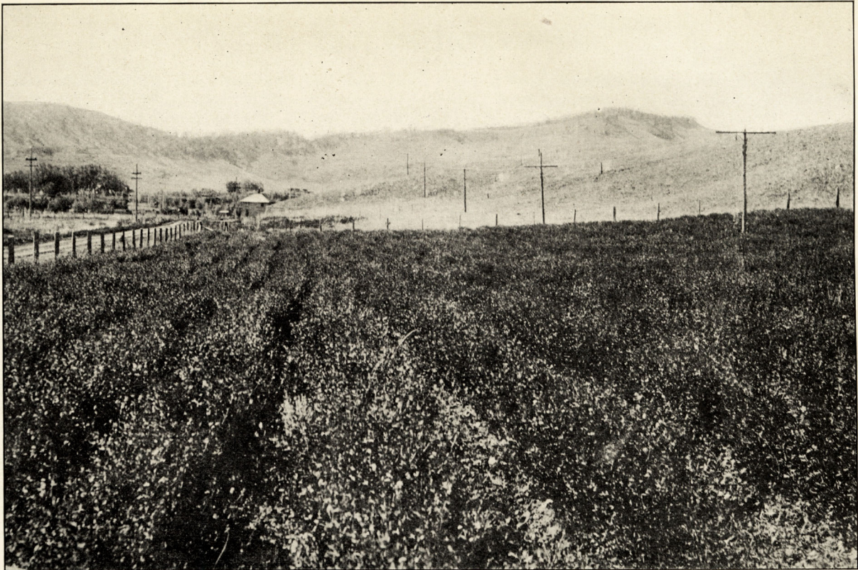
FIG. 1.—Alfalfa in rows, Rapid City, S. Dak.