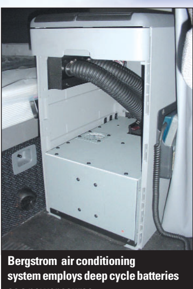
as a power source.

The Carl Moyer Clean Engine Incentive Program in California is funded under Proposition 40 and administered by the California EPA's Air Resources Board. It offers fleets up to $1,500 per vehicle toward the instal-