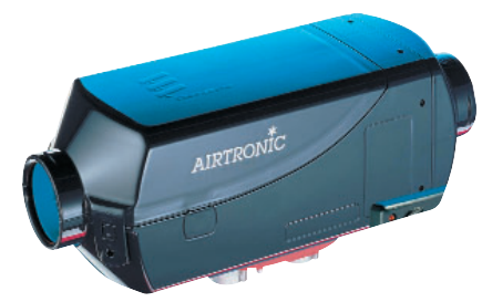
Espar's Airtronic diesel-fired bunk heater is about the size of a loaf of bread.

Caterpillar Engine Co. also offers an idle shutdown timer as a standard feature on its electronic engines. It can be programmed to automatically shut the engine off after three to