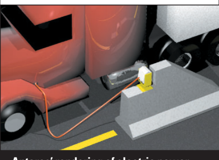
Antares' rendering of electric power pedestal for I-87 TSE demo

Another program that fleets should know about is the New York State Truck Stop Electrification