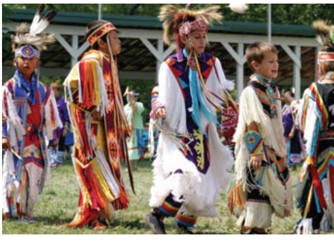
Encourage children to become involved in their community.

Drug dealers have intentionally made these drugs look like candy to entice new users and create a new generation of meth addicts. Tribal leaders, parents, teachers, and others in the community should caution kids about accepting or ingesting these or any other types of drugs. Let children know that if they are unsure of what the substance is or where it came from, they should not use it or accept it.