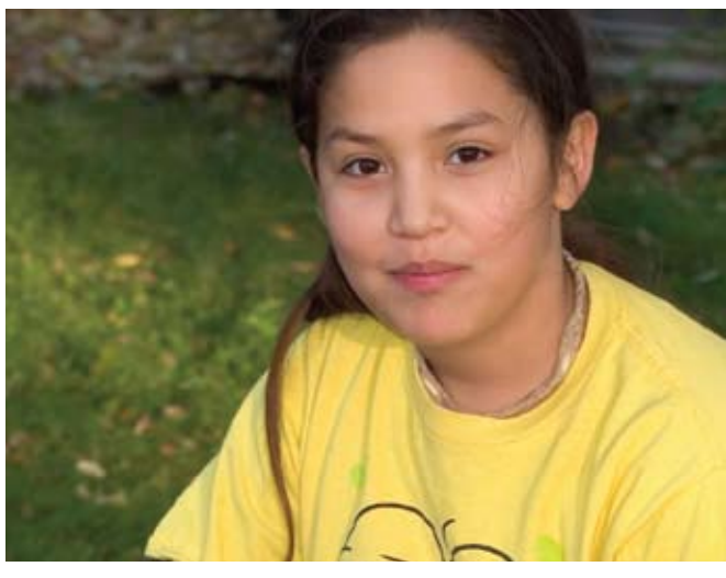
Many resources are available to help with youth education and drug prevention.