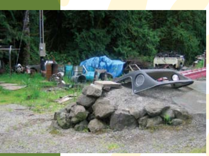
Photograph of a meth lab discovered in a rural location.