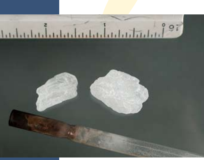
Photograph of ice meth and pipe.

Photos provided courtesy of the U.S. Drug Enforcement Administration. www.usdoj.gov/dea/index.htm