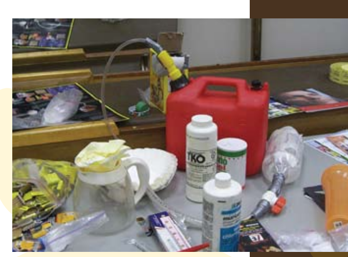
Funding is available for job training to properly recognize and deal with meth labs.

www.cops.usdoj.gov/ default.asp?Item=240