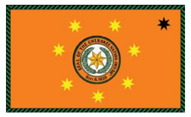
The current flag of the Cherokee Nation.

The following year, the U.S. Department of Justice provided funding to CNEP to purchase equipment for investigating meth labs and to hold a regional meth conference in Tulsa, Oklahoma, partnering with the Oklahoma Bureau of Narcotics. In addition, CNEP began a community education initiative to help tribal members understand meth, its harmful effects, and the dangers posed to human health and the environment by meth labs.