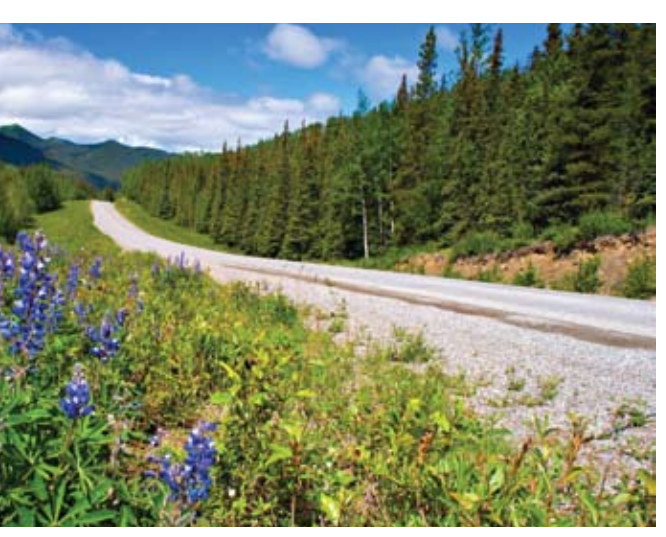
Vast acres of land in the Pacific Northwest make it attractive to meth producers.

A trend is emerging in Indian Country. Mobile meth labs-primarily cars and trucks, often stolen-are being found on reservations. Meth producers are drawn to the area by the rural setting and the knowledge that they are entering a tribal jurisdiction.