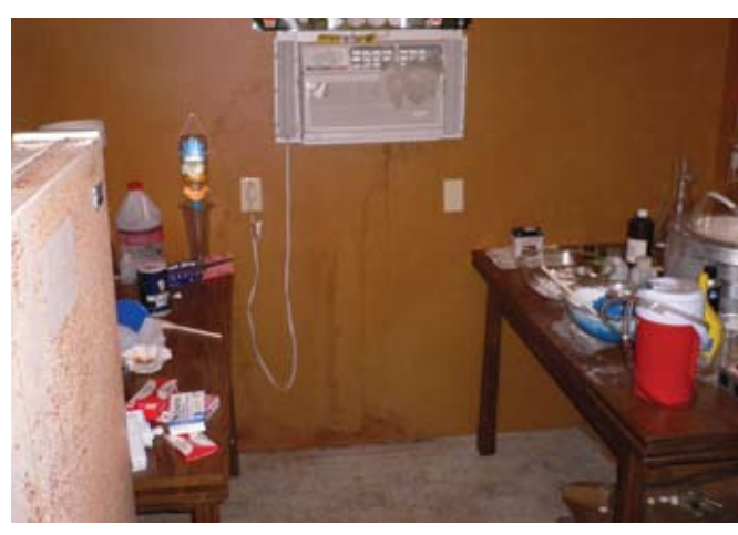
Photograph of an active meth lab discovered in a home.