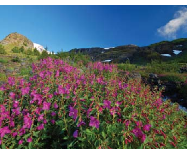
Funding is available to help with land revitalization.

The following list describes funding opportunities provided by various government agencies and other organizations to help tribes.