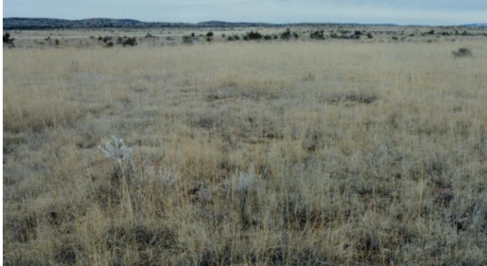
Figure 1: Illustration of area which would not meet treatment criteria

The following photographs depict areas within Tularosa Grassland Restoration project.