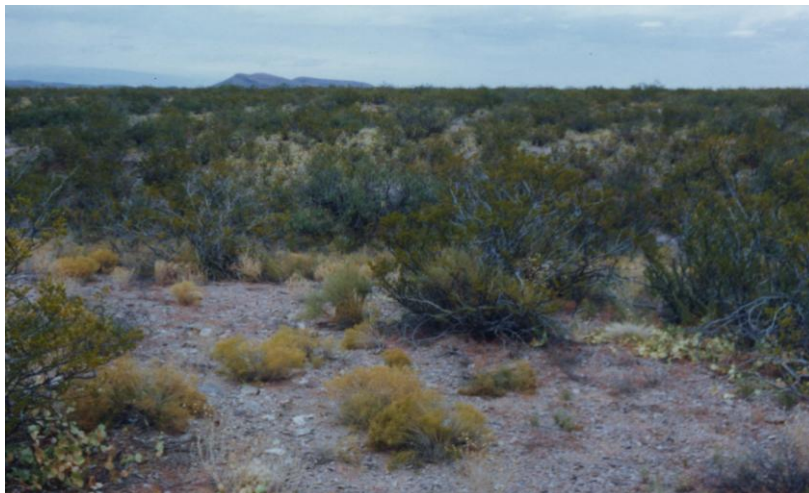
Figure 3: Illustration of potential treatment for creosote reduction