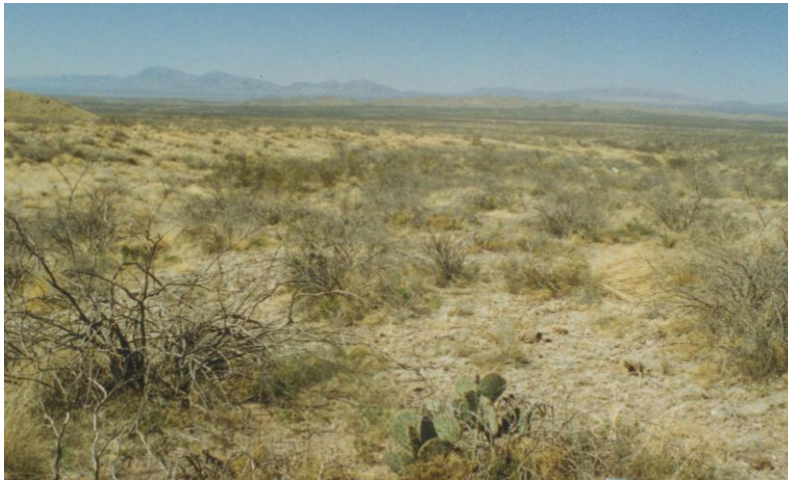
Figure 2: Illustration of potential treatment for acacia catclaw reduction