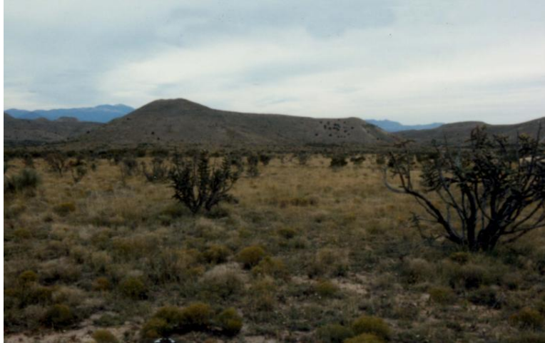
Figure 4: Illustration of potential treatment for cholla reduction