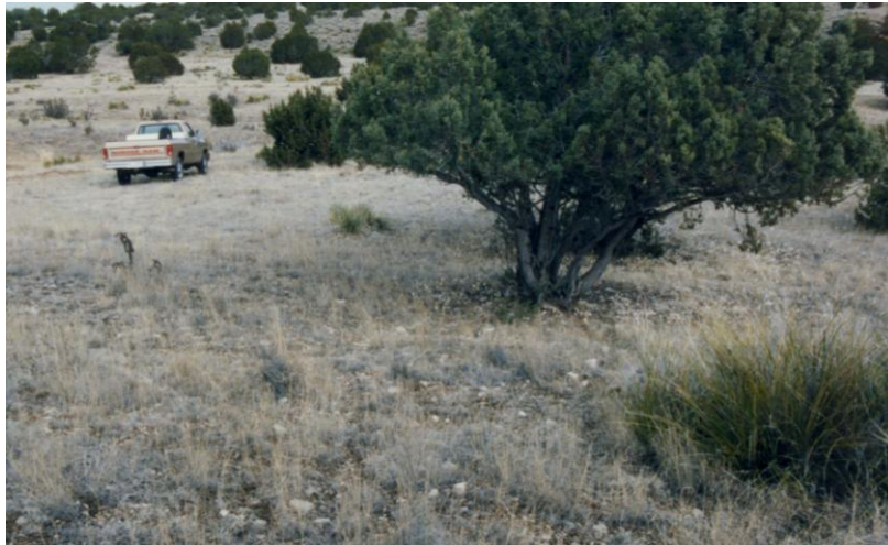
Figure 5: Illustration of potential treatment for juniper reduction