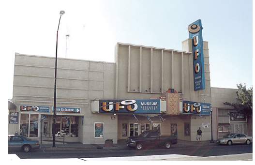
UFO Museum in Roswell, N.M.