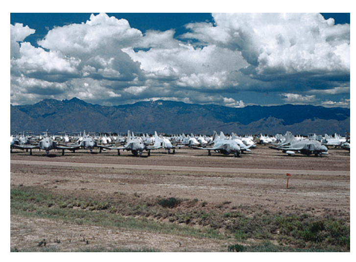
Thousands of F-4 Phantoms are parked at the airplane graveyard at Davis-Monthan Air Force Base in Tucson.