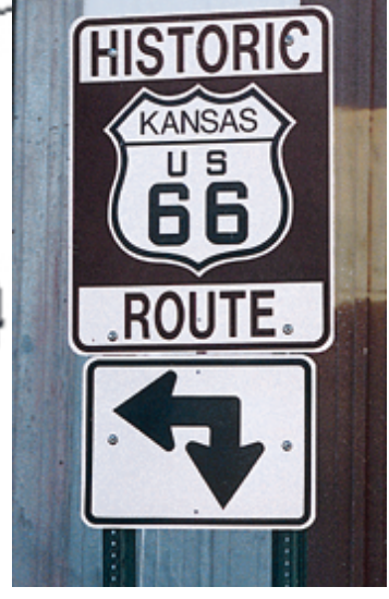
Signs mark the highway, making it easier to follow the original route.