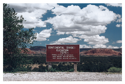
The Continental Divide separates the United States by rainfall. Rainfall to the west of the divide drains into the Pacific Ocean. Rainfall to the east drains into the Atlantic.