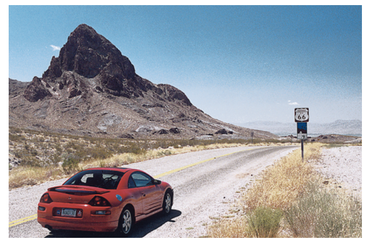
Much of Route 66 is rugged, as is this stretch of highway in Western Arizona.