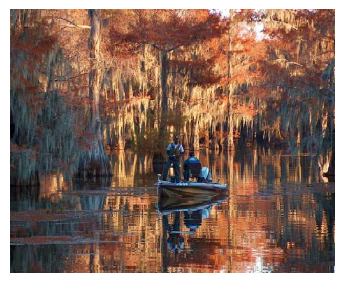
Fishing in Cypress Swamp, Photo by Kristine Carrier

The National Wildlife Refuge System, managed by the U.S. Fish and Wildlife Service, is the only national network of public lands set aside specifically for the protection and conservation of fish, wildlife, and plants. Born in 1903 as a result of President Theodore Roosevelt's order to protect a small island in Florida as a "preserve and breeding grounds for native birds", the National Wildlife Refuge System now includes more than 540 refuges. Today, the 95 million acres of land and water provide important habitat for nearly 260 threatened or endangered species and hundreds of other fish, wildlife, insect, and plant species. More than 30 million Americans visit national wildlife refuges each year. While the needs of wildlife must come first, many refuges welcome those who want to enjoy the natural world: to observe or photograph wildlife, to hunt or fish, or to learn about wildlife and their needs.