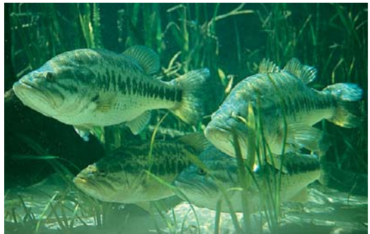
Largemouth Bass