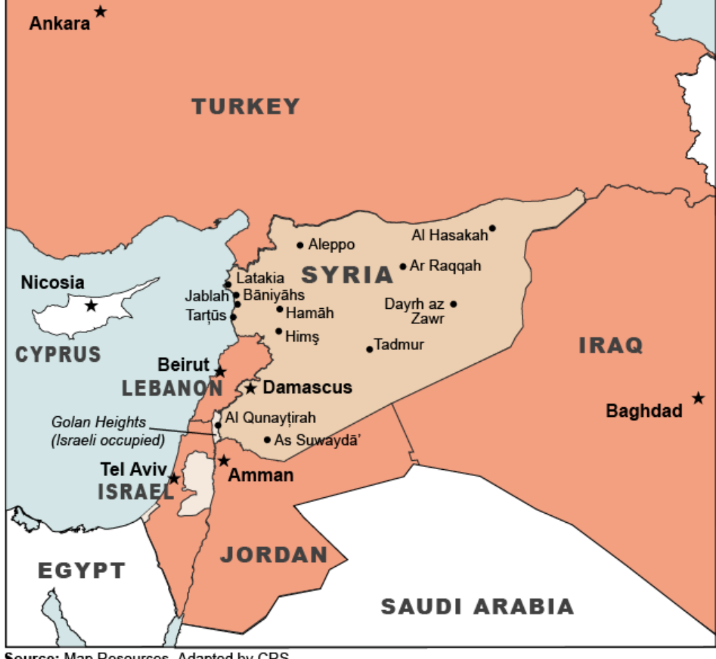
Figure 1. Map of Syria

The Military and Security Establishment. The role of the armed forces and national security services has figured prominently in most Syrian regimes and predates by some years the establishment of the Ba'thist regime. Factionalism within the armed forces was a key cause of instability in Syria in the past, as military cliques jockeyed for power and made and unmade governments with considerable frequency. This situation changed abruptly after 1970 as the elder Asad gained a position of unquestioned supremacy over the military and security forces. The late president appointed long-standing supporters, particularly from his Alawite sect, to key military command positions and sensitive intelligence posts, thereby creating a military elite that could be relied upon to help maintain the Asad regime in power. According to one Syria expert, "Within the military, Bashar has replicated the patron-client relationship wielded so effectively by his father. Despite repeated rumors about tension within the Assad family, there is no evidence that any rival most notably Asaf Shawkat, Bashar's brother-in-law and the head of the Shu'bat al-Mukhabarat al-'Askariyya (military security department), or Bashar's younger brother Mahir, an officer in a Republican Guards division — has sufficient power to challenge his rule."12