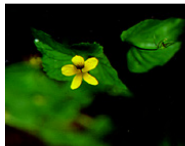
Downy yellow violet ( viola pubescens ).

To many of us, spring means the return of wildflowers to field and woodland, where we enjoy them simply for their beauty. For many centuries however, wildflowers were sought for their wealth of uses, ranging from food, medicine and dyes to magical charms and potions. Over time, the powers of certain plants to cure sickness or dispel evil spirits gave them a spiritual characteristic. Legends and superstitions were created to explain their magical nature. Many of the practical uses of wildflowers are no longer familiar to us, but perhaps some traces of the magic and superstitions still remain.