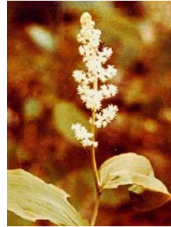
False Solomon's seal.

The common blue violet ( viola cucullata ) has a surprising variety of uses. Even before the days of the Roman Empire, women picked these flowers to mix with goat's milk for a facial tonic. The leaves and flowers of the violet are edible, and contain high quantities of vitamins C and A. In fact, pound for pound, violets contain three times as much vitamin C as oranges. The flowers have been made into candy, jam, syrup, wine, and a tea for curing headaches. Scientists have even used the blossoms to determine the acidity or alkalinity of a substance before modern testing methods were invented. The juice from crushed violet blossoms turns red if it is touched by an acid, and green if touched by a base. A less scientific use of the plant was to wear a garland of violets around your neck to dispel the odors of wines and spirits, thus preventing drunkenness.