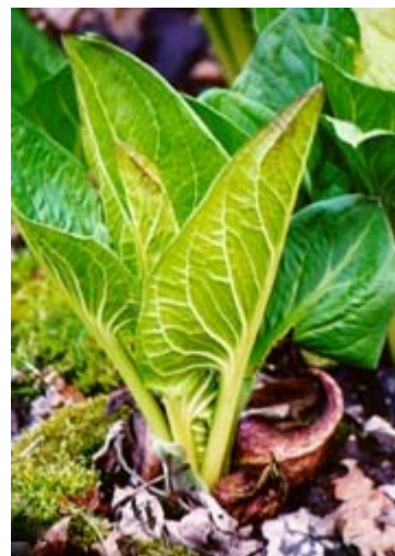
Skunk cabbage spathe encircles a spadix of small flowers ( lower right .)

One of the first spring flowers to catch our eye is usually not recognized as a flower at all, because its blossoms are not easily noticeable. The purple, green, and brown mottled leaf tips of skunk cabbage ( symplocarpus foetidus ) are poking through the soil in wet woodland areas as early as February, even when snow still covers the ground. When the temperature climbs above freezing, the flower buds of the skunk cabbage begin to enlarge, and the plant produces heat. With the help of its spongy leaves, the skunk cabbage can maintain a temperature of about 70 degrees. This may help release the plant's skunk-like odor. The bad smell makes most people turn away from the plant, but the American Indians found that breathing in the strong fumes from the crushed leaves could help cure a headache.