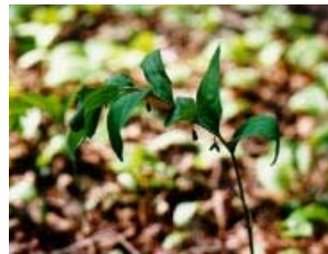
Solomon's seal before the flowers turn yellow.