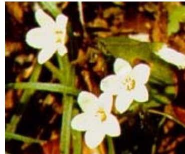
Wood anemone ( anemone quinquefolia ).