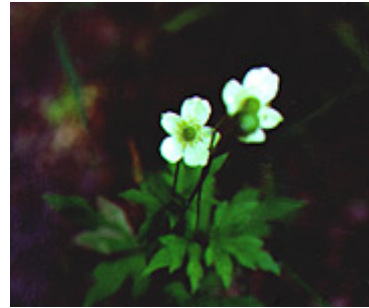
Thimbleweed ( anemone virginiana ).

There are as many uses for this wildflower as there are stories about its name. American Indians ground the root to make flour, or sometimes would eat the root pickled. If the root is crushed and applied to a