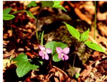
Common blue violet.

The common blue violet ( viola cucullata ) has a surprising variety of uses. Even before the days of the Roman Empire, women picked these flowers to mix with goat's milk for a facial tonic. The leaves and flowers of the violet are edible, and contain high quantities of vitamins C and A. In fact, pound for pound, violets contain three times as much vitamin C as oranges. The flowers have been made into candy, jam, syrup, wine, and a tea for curing headaches. Scientists have even used the blossoms to determine the acidity or alkalinity of a substance before modern testing methods were invented. The juice from crushed violet blossoms turns red if it is touched by an acid, and green if touched by a base. A less scientific use of the plant was to wear a garland of violets around your neck to dispel the odors of wines and spirits, thus preventing drunkenness.