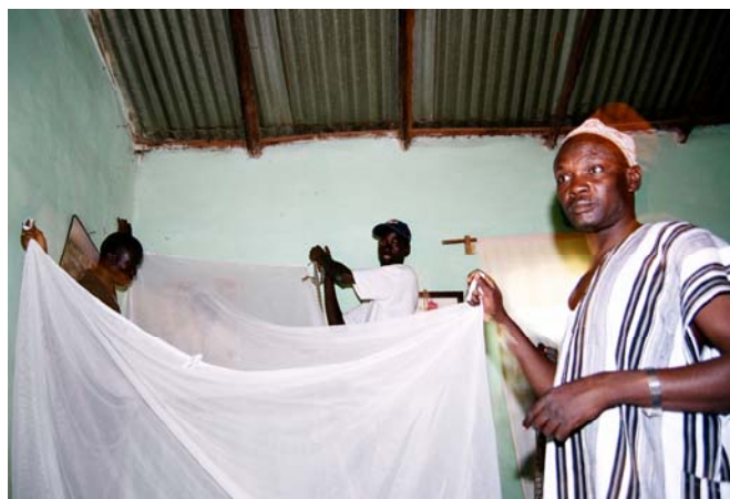
The distribution of insecticide-treated bed nets is a key intervention in malaria control.

Given the disease kills millions and is readily preventable and treatable, the authors encourage the international community to seize the opportunity to reduce massively this human disease burden at such a low cost.