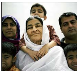
This Syrian woman has lost her leg as a consequence of diabetes.