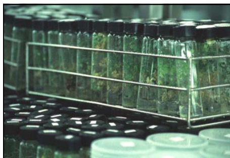
Tissue cultures of Artemisia annua.

Scientists from the University of California at Berkeley are collaborating with private industry and non-profit organizations to improve this situation by producing strains of baker's yeast that can also synthesize the compound. By inserting plant genes into the yeast cells, all of the chemical steps needed to produce artemisinin can be accomplished in a much more efficient