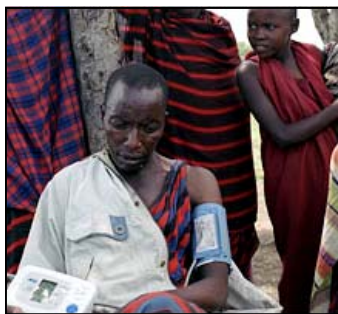
Cardiovascular diseases are a leading cause of death in Africa.