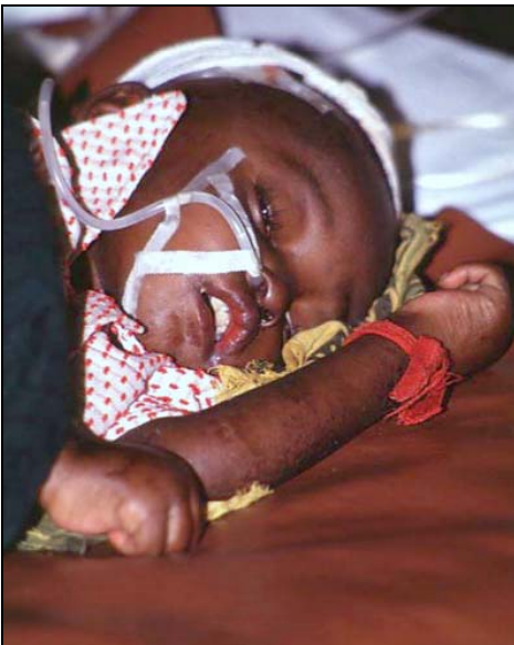
An African child dies of malaria every 30 seconds.

"The extraordinary advances highlighted in this valuable publication reflect a new commitment by the international community to confront malaria with fervor and funding," according to Dr. Fauci. "As a result of recent research, we now have new drugs that are highly effective in treating malaria, new and improved vector control strategies, and a widening pipeline of promising vaccine candidates. Even so, much remains to be done."