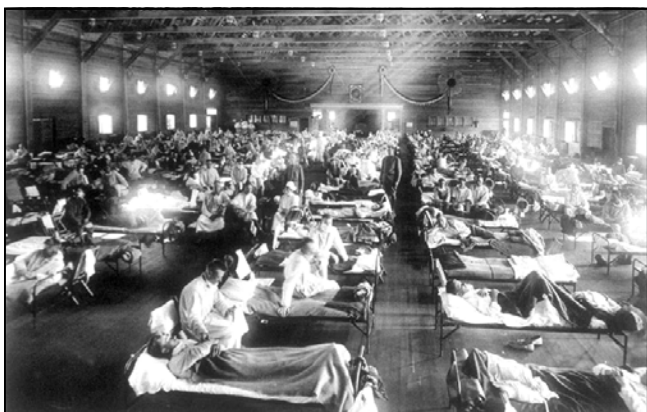
The 1918 Spanish Flu Epidemic killed more than 50 million people worldwide.

The study team, including Fogarty scientist Cécile Viboud, report only .02 percent of Copenhagen's population died during the summer wave, as compared with .27 percent during the fall wave. Similar patterns were observed in three other Scandinavian cities and likely represent a wider European or even global experience, the study suggests.