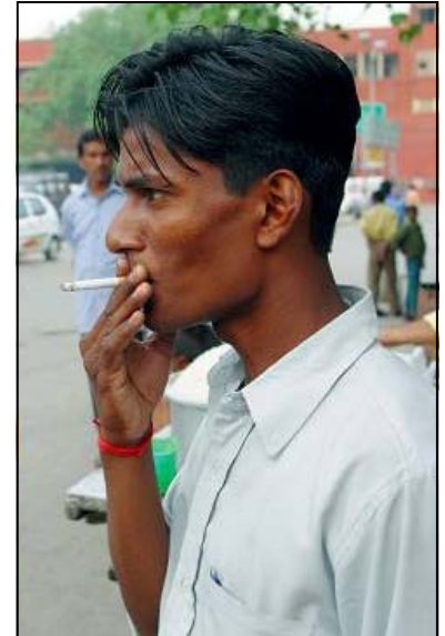
There are about 120 million smokers in India.

Men who smoked cigarettes lost an average of ten years of life, while smoking bidis cut an average of six years from life expectancy. The study found there were no safe levels of smoking. While the hazards of smoking even a few bidis a day raised mortality risks by one-third, consuming the same number of cigarettes nearly doubled the risk of death in middle age.