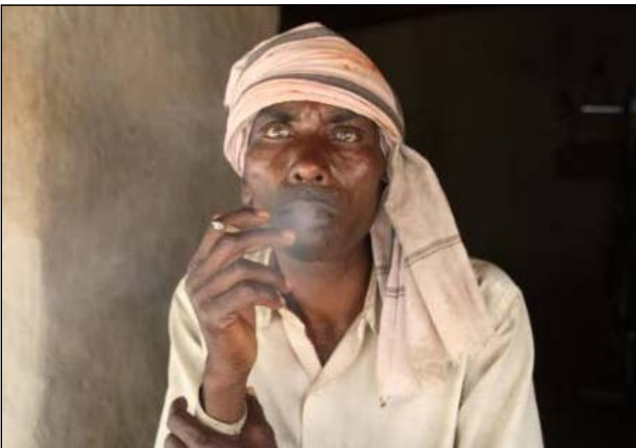
Cheaply made cigarettes known as bidis are inexpensive and popular in India.

"I am alarmed by the results of this study," said India's Health Minister Dr. Abumani Ramadoss. "The government of India is trying to take all steps to control tobacco use—in particular by informing the many poor and illiterate of smoking risks."