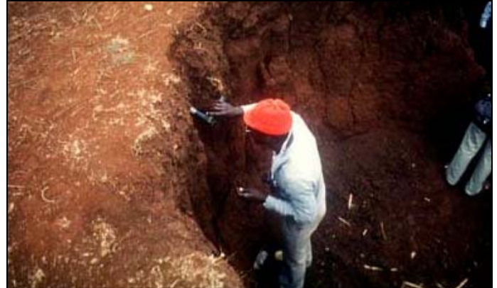
Large numbers of insects collect in brick pits such as this one in Kenya.

Some human activities are particularly conducive to the formation of mosquito habitats, he said, including the traditional method of farming rice in paddies, the use of stagnant ponds to mine clay for brick making and even littering. "Plastic bags are especially disastrous for Africa," according to Dr. ole-MoiYoi. "They are everywhere."