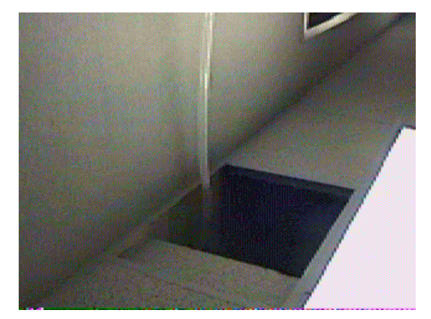
Figure J3 - a picture of the hose passing through the ceiling membrane.