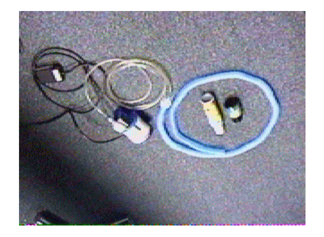
J1 - a picture of the setup.