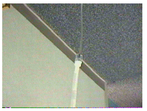
Figure J2 - a picture of the nebulizer