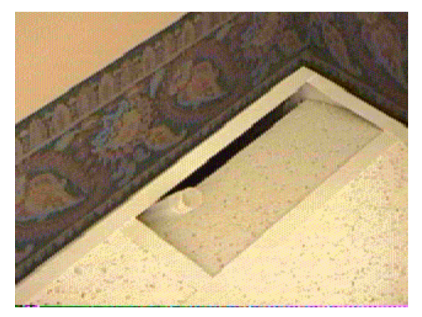
Figure J4 - a picture of the delivery hose terminating in the sleep room.