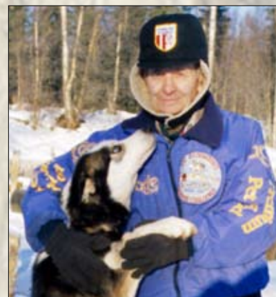
“Trail work is never done.” - Joe Redington Sr., “father of the Iditarod”