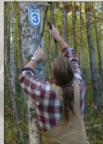
Volunteer working on the trail outside of Knik, Alaska.

Every year local groups, community clubs and individuals contribute their personal time and money to maintain and improve the Iditarod Trail. The statewide, nonprofit Iditarod National Historic Trail, Inc., helps protect and improve the trail and keeps the “lore of the trail” alive. Your support of these efforts, like the hard work of past Iditarod trail breakers, will ultimately keep the route open for another century!