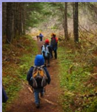
The Iditarod Trail in Girdwood is a favorite with hikers of all ages.

One hundred years after its heyday, some variation of the entire Historic Iditarod Trail from Seward to Nome is still open to the public.