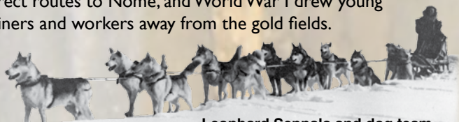
Leonhard Seppala and dog team.

By 1918 the stampede reversed itself. New winter mail contracts bypassed the fading town of Iditarod in favor of more direct routes to Nome, and World War I drew young miners and workers away from the gold fields.