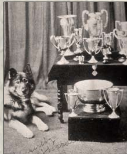
Togo, the famous lead dog for Leonhard Seppala's dog team on the Serum Run, with trophies awarded for saving Nome, Alaska.

In the winter of 1925, a deadly outbreak of diphtheria struck fear in the hearts of Nome residents. There was not enough serum to inoculate everyone and winter ice had closed the port city from the outside world. Serum from Anchorage was rushed by train to Nenana. Twenty of Alaska's best mushers and their sled dog teams relayed the serum 674 miles from Nenana to Nome in less than five and one-half days!