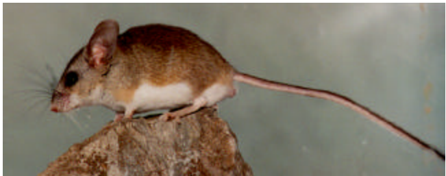
White-Ankled Mouse

seabed habitats along the base of the escarpment. The altitudinal range of white-ankled mice in the park extends from 3,700 to 6,390 feet in elevation.