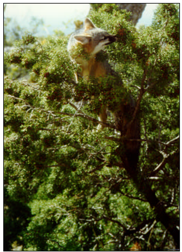
A Gray Fox makes a meal of juniper berries.

Over a period of 22 years, I observed 65 gray foxes during my studies at the park. Most sightings of this canid occurred at night along Walnut Canyon, but I also saw them during daylight hours at Oak Springs and Bat Cave Draw. These diurnal sightings and others along Walnut Canyon occurred on the afternoons of 24 March, 22 April, 23 May, 15 August and 1 September. Gray foxes are most commonly observed in mid-spring. Thus far, I am unaware of any records of this species from habitats on the seabed.