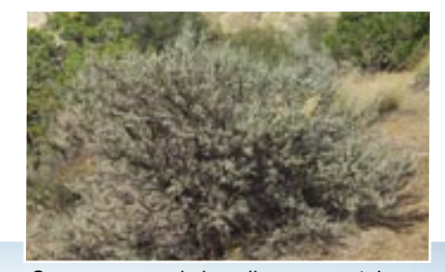
Sage grouse rely heavily on mountain and Wyoming big sagebrush for food and cover.

Other sources of information on sage grouse include the U.S. Fish and Wildlife Service, the U.S. Bureau of Land Management, and state fish and game departments.