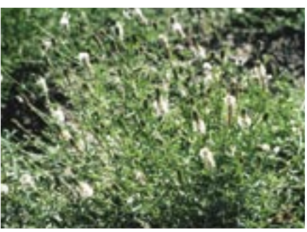
Antelope germplasm slender white prairie clover.