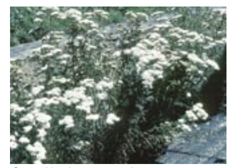
Great Northern germplasm western yarrow.

Stillwater germplasm prairie coneflower.