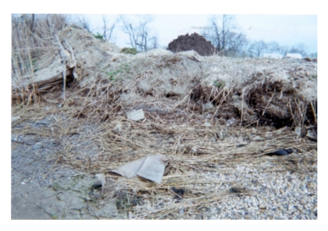
Photograph 10: Close-up of the material that makes up the shoreline. The shoreline is mostly loosely consolidated soils with a significant amount of cobble sized (and larger) rubble.