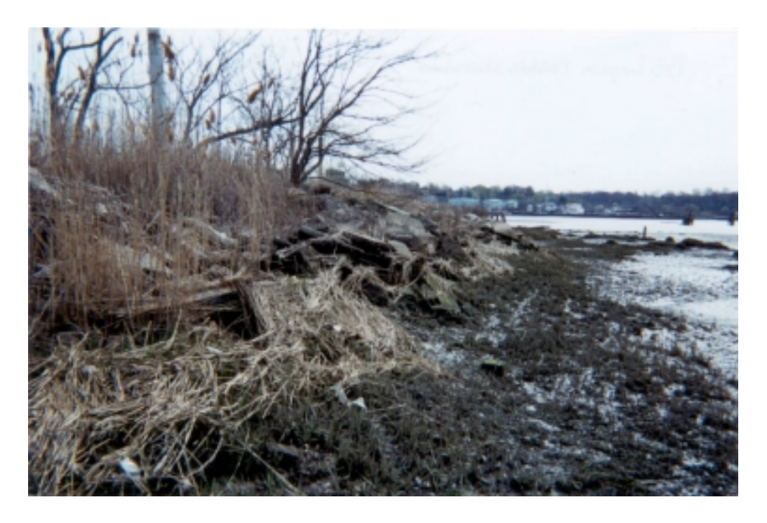
Photograph 9: Another view of the northern shoreline of the Bar Beach Lagoon. In this photograph large rubble debris can be seen. The tall light brown vegetation is Phragmites. The green vegetation found along the high water line is mostly Spartina. This shoreline could be recontoured to create additional inter-tidal area appropriate for Spartina colonization. The rubble may need to remain in order to stabilize and trap sediments.