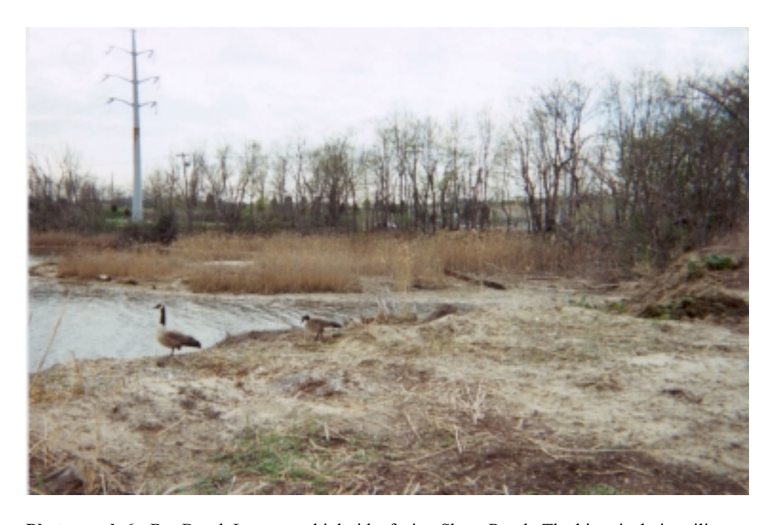
Photograph 6: Bar Beach Lagoon at high tide, facing Shore Road. The historical pier pilings cannot be seen and are submerged below the open water area, only Phragmites remain above the water surface. Upland trees makeup the outer perimeter of this lagoon/inlet.