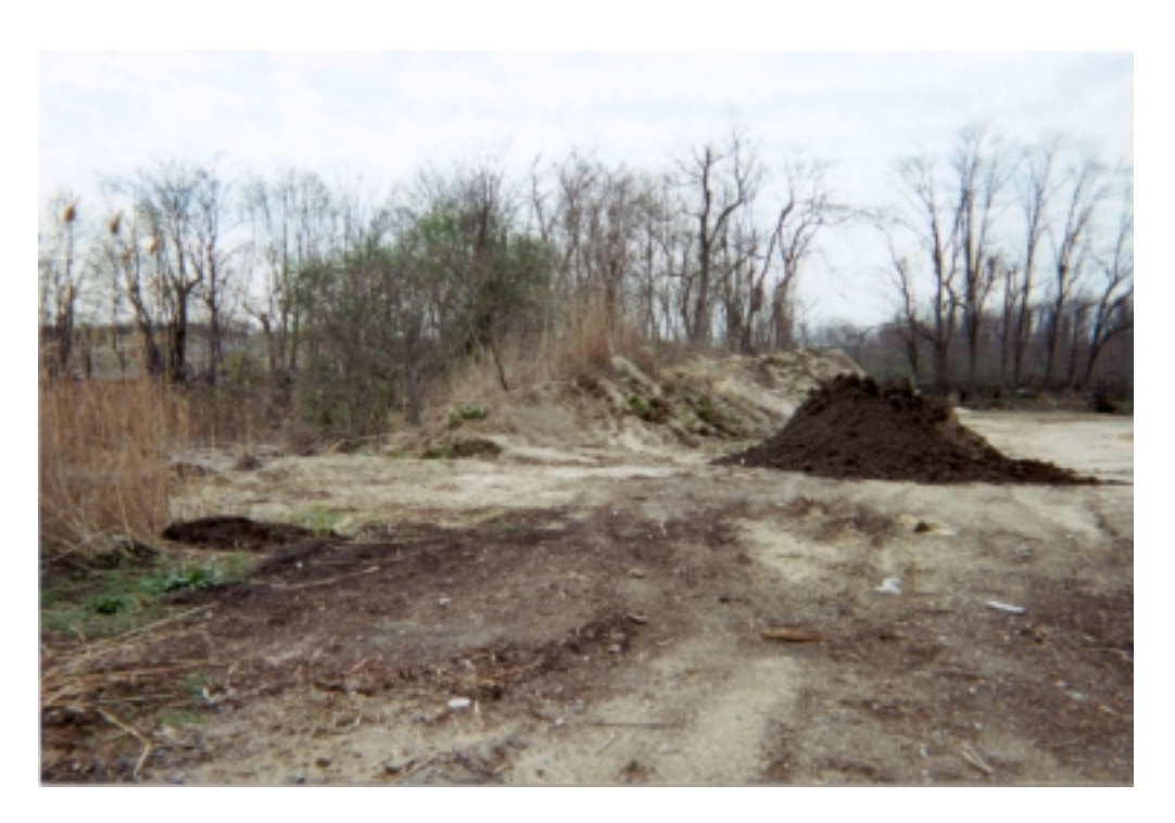
Photograph 11: Additional soil material that is owned by the Town of North Hempstead, which may be available for fill material.