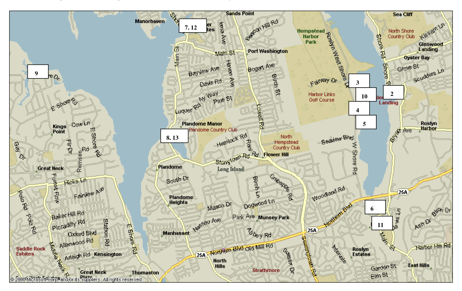
Exhibit IV. Map of Town of Hempstead Harbor Shoreline Trail Project