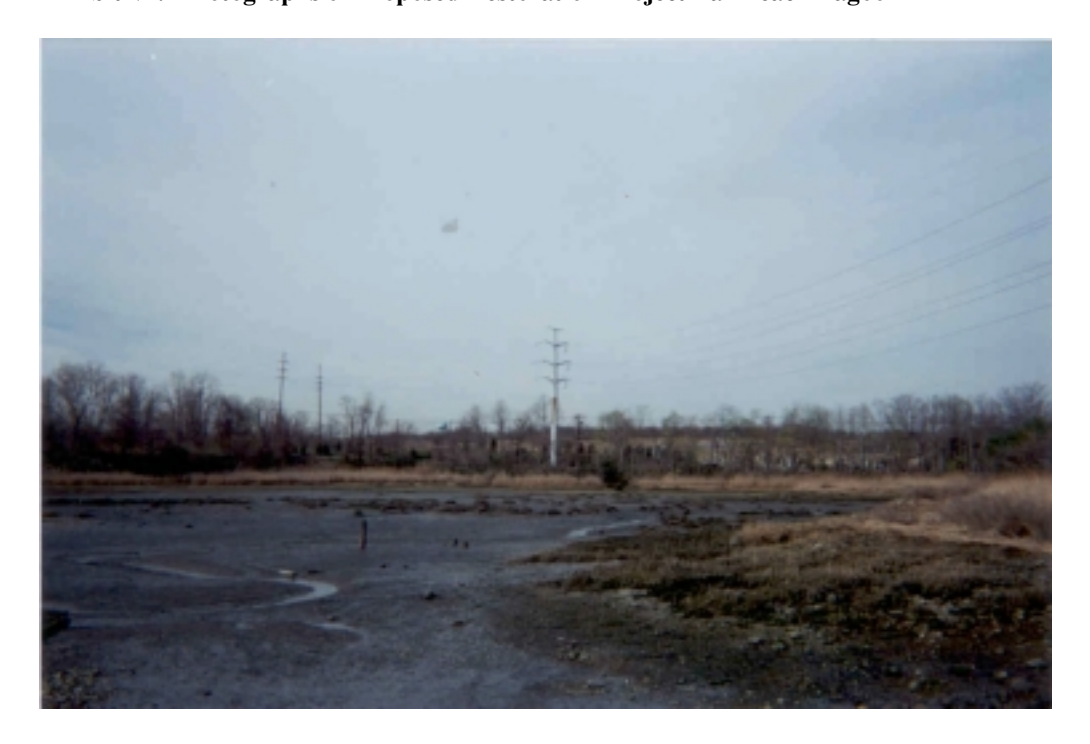
Photograph 1: Bar Beach Lagoon at low tide, facing inland from Hempstead Harbor. In the background is Shore Road. In the middle of the photograph one of several channels that meander through the lagoon can be seen along with an area where small clumps of Spartina remain (darker green area in middle of photograph). The light brown area that is along the perimeter of the tidal flats is the area that has been invaded by Phragmites.