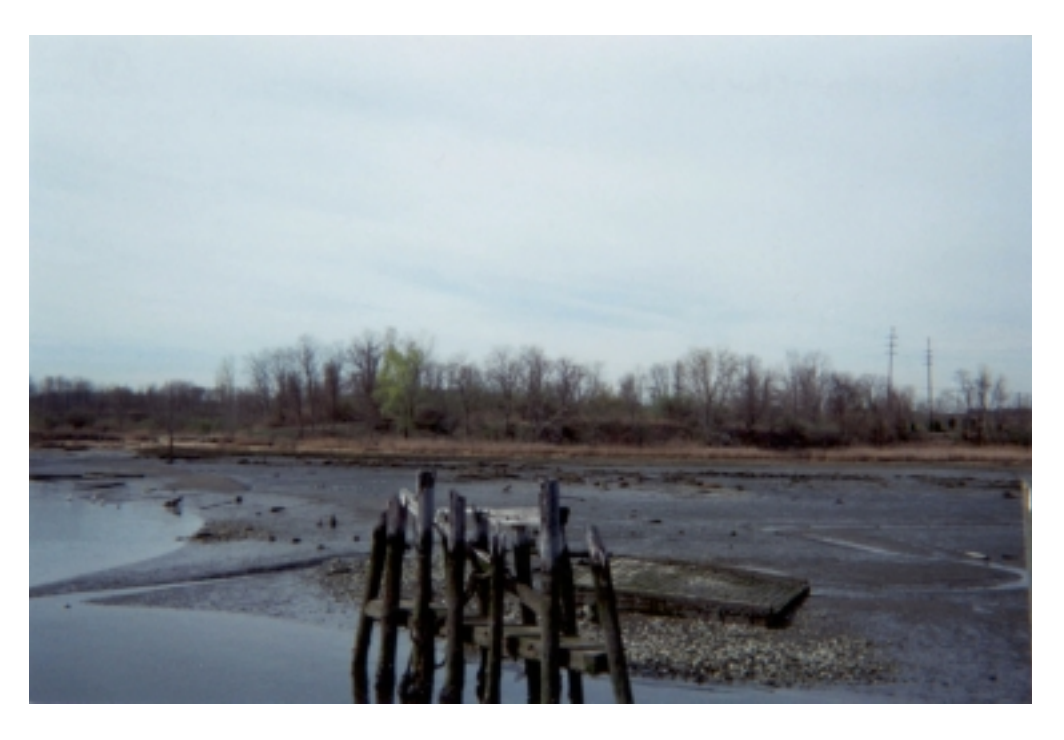
Photograph 3: Bar Beach Lagoon at low tide, facing the south side of the lagoon with Hampstead Harbor on the left and Shore Road on the right. Historical pier pilings can be seen in the foreground and Spartina clumps scattered in the middle of the tidal flats area.