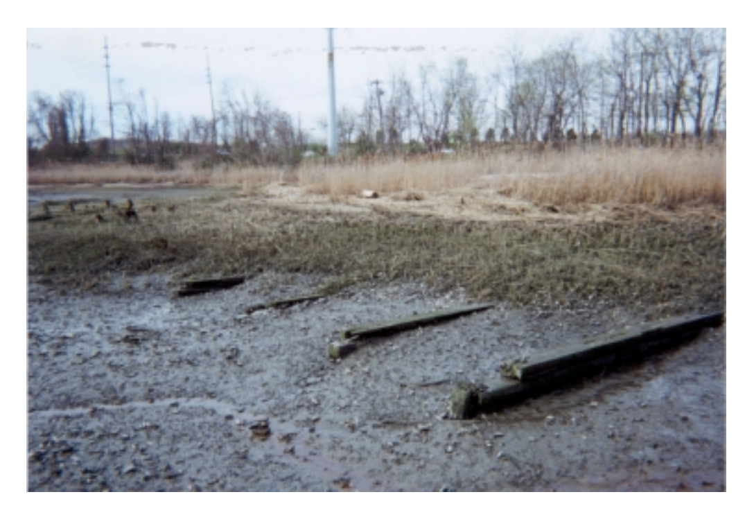
Photograph 5: Bar Beach Lagoon at low tide, facing Shore Road which is at the top of the photograph. Historical pier pilings can be seen in the foreground. Spartina is the green area immediately above the pilings, with Phragmites (light brown) above the Spartina.