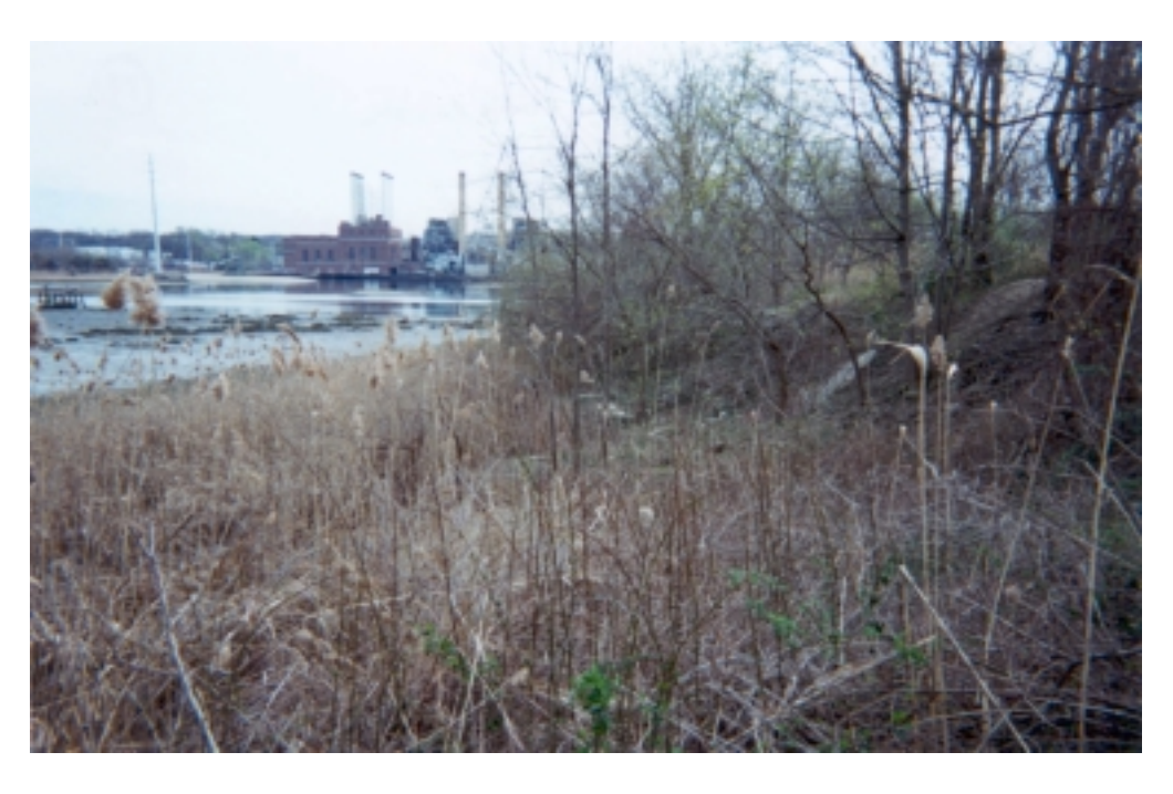
Photograph 14 : The southern shoreline of Bar Beach Lagoon as viewed from the trail way, is inundated by Phragmites.