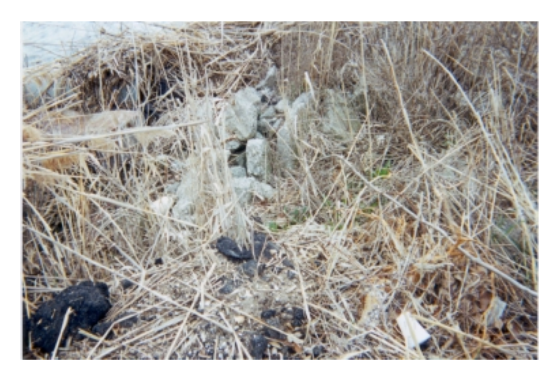
Photograph 8: Close-up of the material that makes up the shoreline. The shoreline is mostly loosely consolidated soils with a significant amount of cobble sized (and larger) rubble.