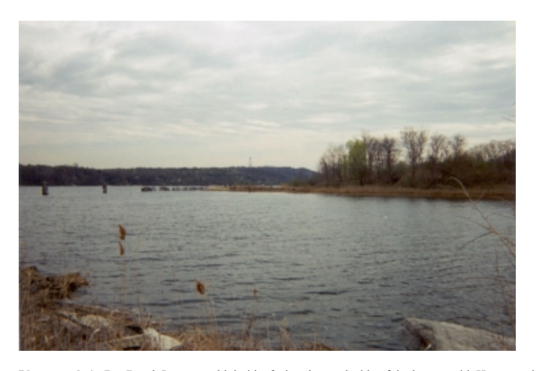
Photograph 4: Bar Beach Lagoon at high tide, facing the south side of the lagoon with Hampstead Harbor on the left and Shore Road on the right. Only a small portion of the historical pier pilings can still be seen on the left side during high tide. In the foreground a few Phragmites stems/blooms can be seen.