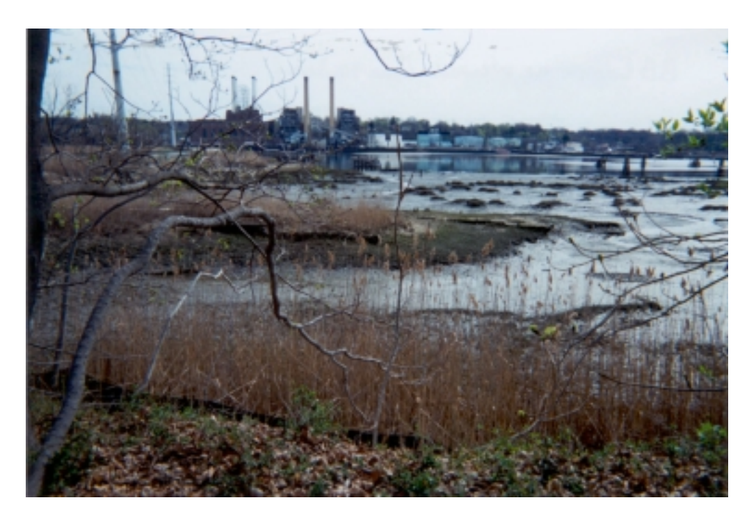
Photograph 13: Another view of the Bar Beach Lagoon from the trail way along Shore Road, looking out towards Hempstead Harbor. The light brown, tall vegetation is Phragmites. The darker green areas and clumps are Spartina. This photograph clearly shows the difference in topographic elevation of the tidal flat areas and the Spartina clumps. Additional sediment would have to be placed in the tidal flat areas for Spartina planting to be successful. If the Phragmites were removed the elevation would most likely be reduced to an elevation appropriate for Spartina recolonization.