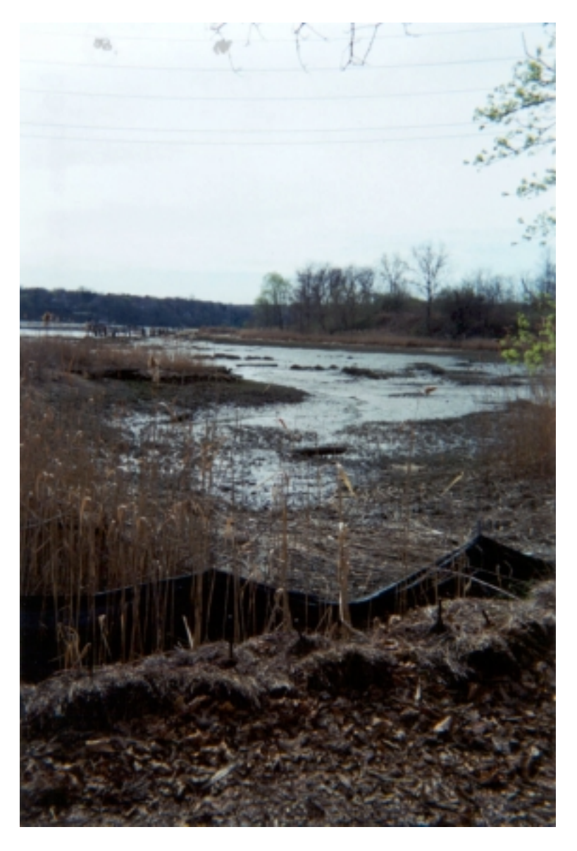
Photograph 12: A view of Bar Beach Lagoon from the trail along Shore Road, looking our towards Hempstead Harbor. Phragmites can be seen in the foreground of the photograph along with sediment fencing that has been placed along the trail way to prevent shoreline erosion.