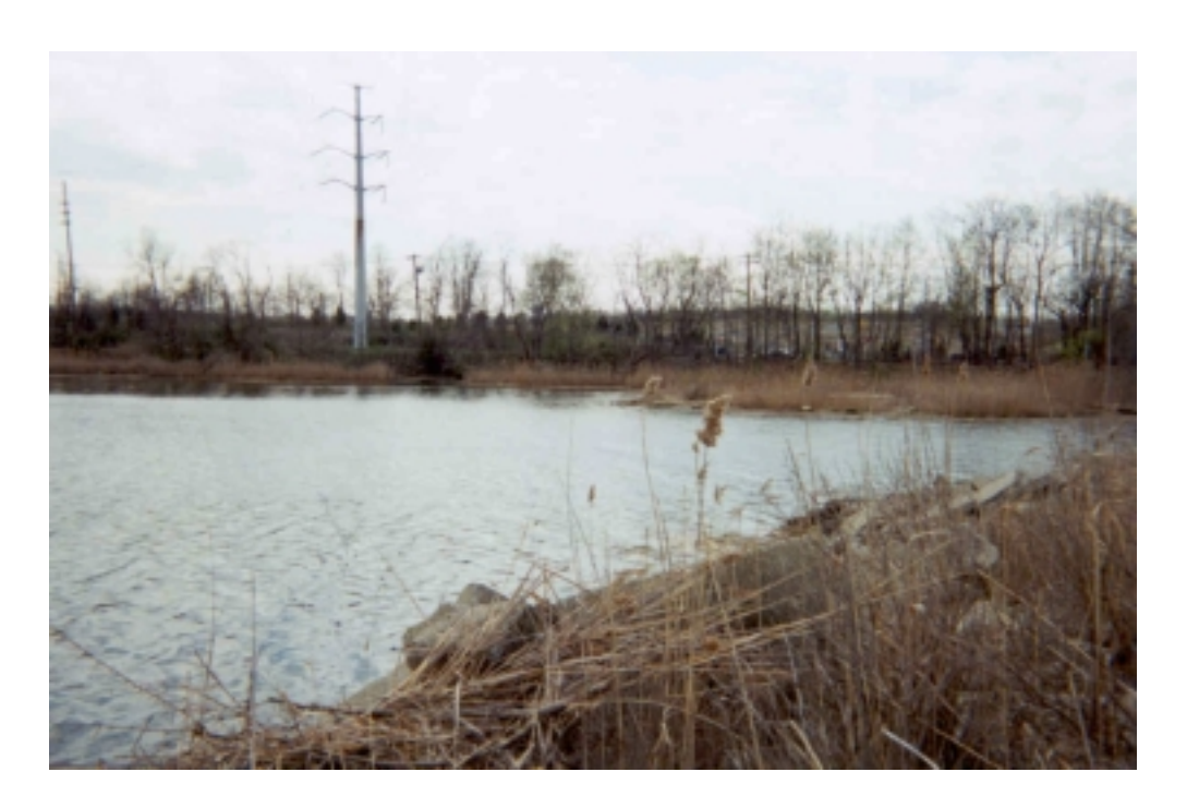
Photograph 2: Bar Beach Lagoon at high tide, facing inland from Hempstead Harbor. In the background is Shore Road. The only vegetation that appears in this photograph is the brownish Phragmites. No emergent grasses are present in this photograph because they are submerged. Spartina may become visible in a month once it has regrown from its winter dieback.