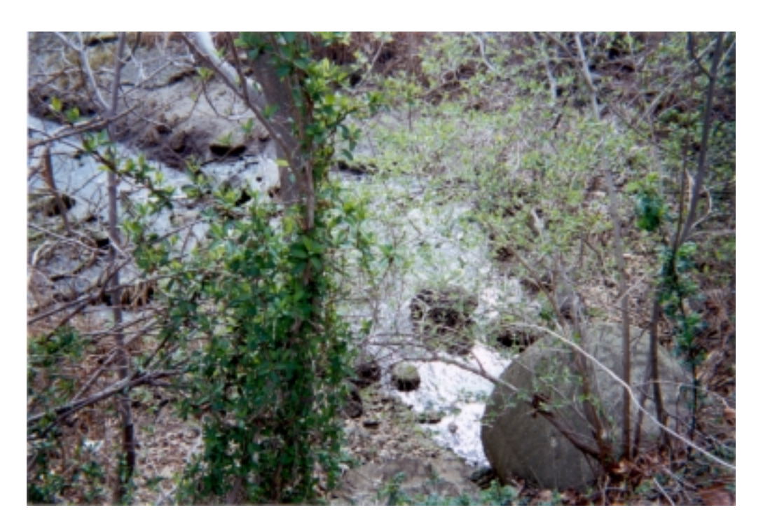
Photograph 15: The 24 stormwater outfall that discharges into the Bar Beach Lagoon that runs under Shore Road and the trail way discharges into the lagoon once it enters the lagoon. This photograph was taken at low tide in the lagoon and on a clear non-rainy day, thus the outfall appears to have a continuous discharge. The discharge appears to have created the channels that meander throughout the tidal flats. The County, according to Denise Herrington of the town of North Hempstead, apparently owns the outfall.