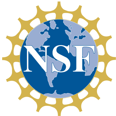
4-color vector logo without shading

The 4-color vector logo without shading is almost identical to the 4-color vector logo. The only difference here is the shading is not present and each component of the logo is a solid color. This logo is for limited use, generally only in the case where we are having patches made, or other uses of embroidery where shading is not possible.