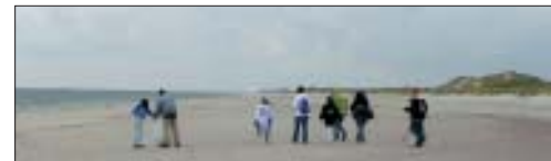
Beach Clean-up Crew 2006