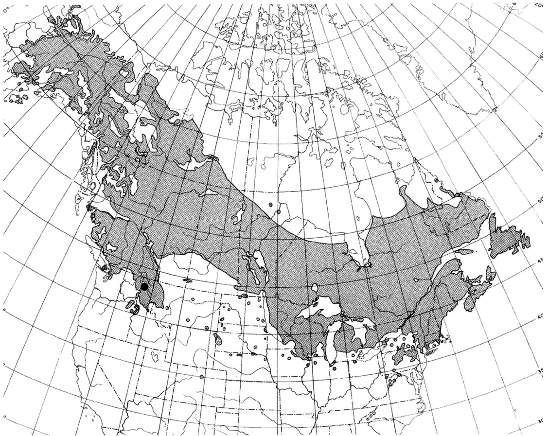
Fig. 1. Distribution of paper birch (Little 1971) and location of study (black dot).

second record of occurrence of D. betulae in Idaho and describe its life stages, reproductive behavior, seasonal history at this location, associated organisms, and host tree characteristics.