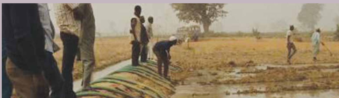
The Kadawa River Project in the northern state of Kano includes a short-range scheme for safeguards against further drought. Here farmers are being taught new irrigation techniques

Economic analysis of the Kano River Project, a major irrigation scheme benefiting from the upstream dams and traditional use of the floodplain, showed that the net economic benefits of the floodplain (agriculture, fishing, fuelwood) were at least US$ 32 per 1000 m 3 of water (at 1989 prices). However, the returns per crops grown in the Kano River Project were at most only US$ 1.73 per 1000 m 3 and when