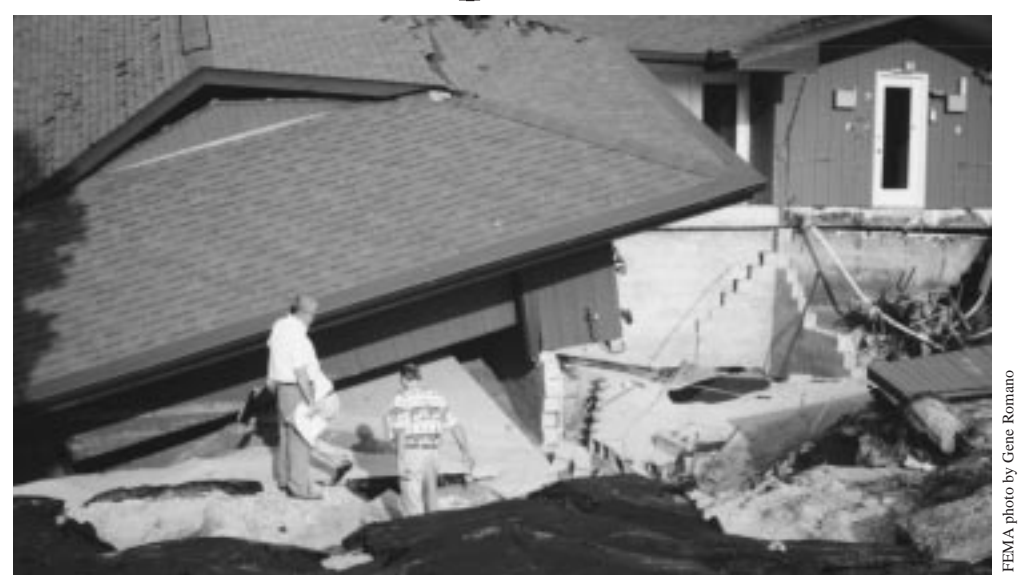
Flash flooding in Sheboygan County undermined the foundation of this house causing it to collapse.