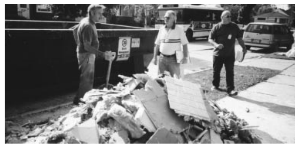
Caution is required when cleaning up flood debris.

The debris left behind by the storms may be a source of injury or illness. State Coordinating Officer Al Shanks urges people to be "extremely careful when cleaning damaged structures or handling debris." Here are some safety tips: