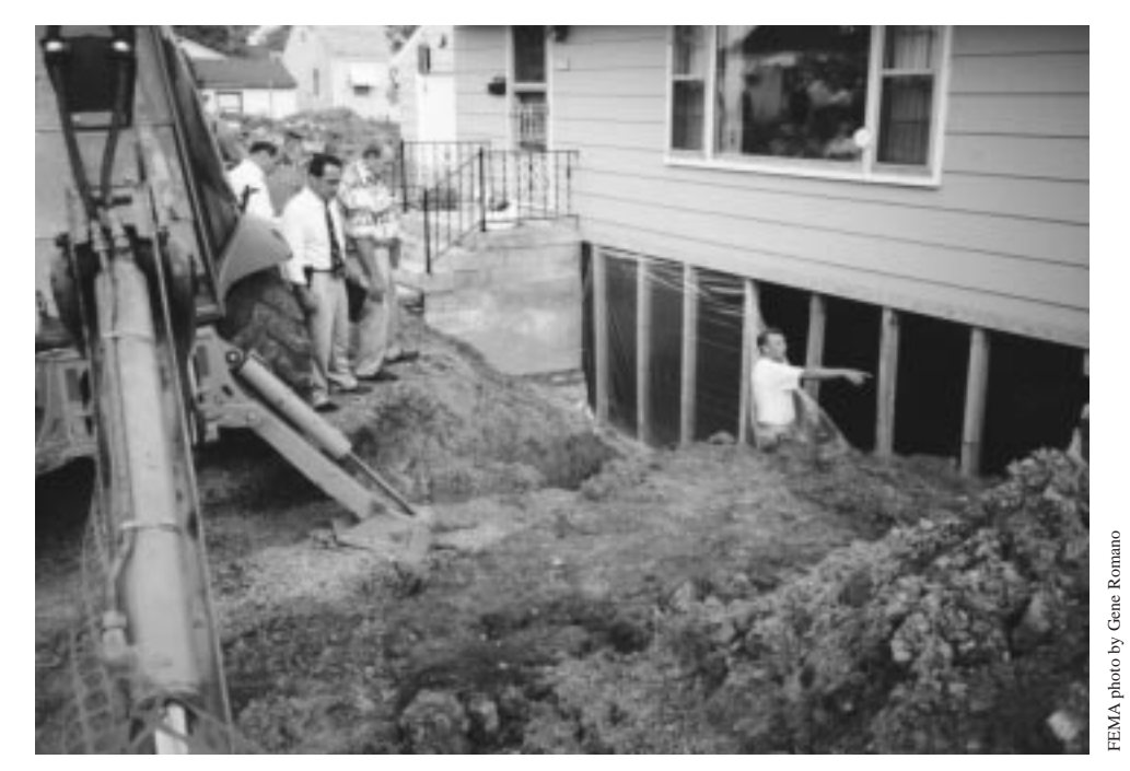
Flood insurance gives homeowners a resource to fix collapsed basements, such as this, caused by flash floods.