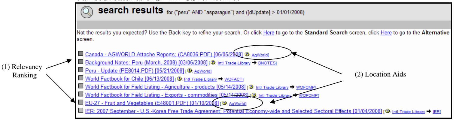
Figure 4: Various features of STAT-USA/Internet