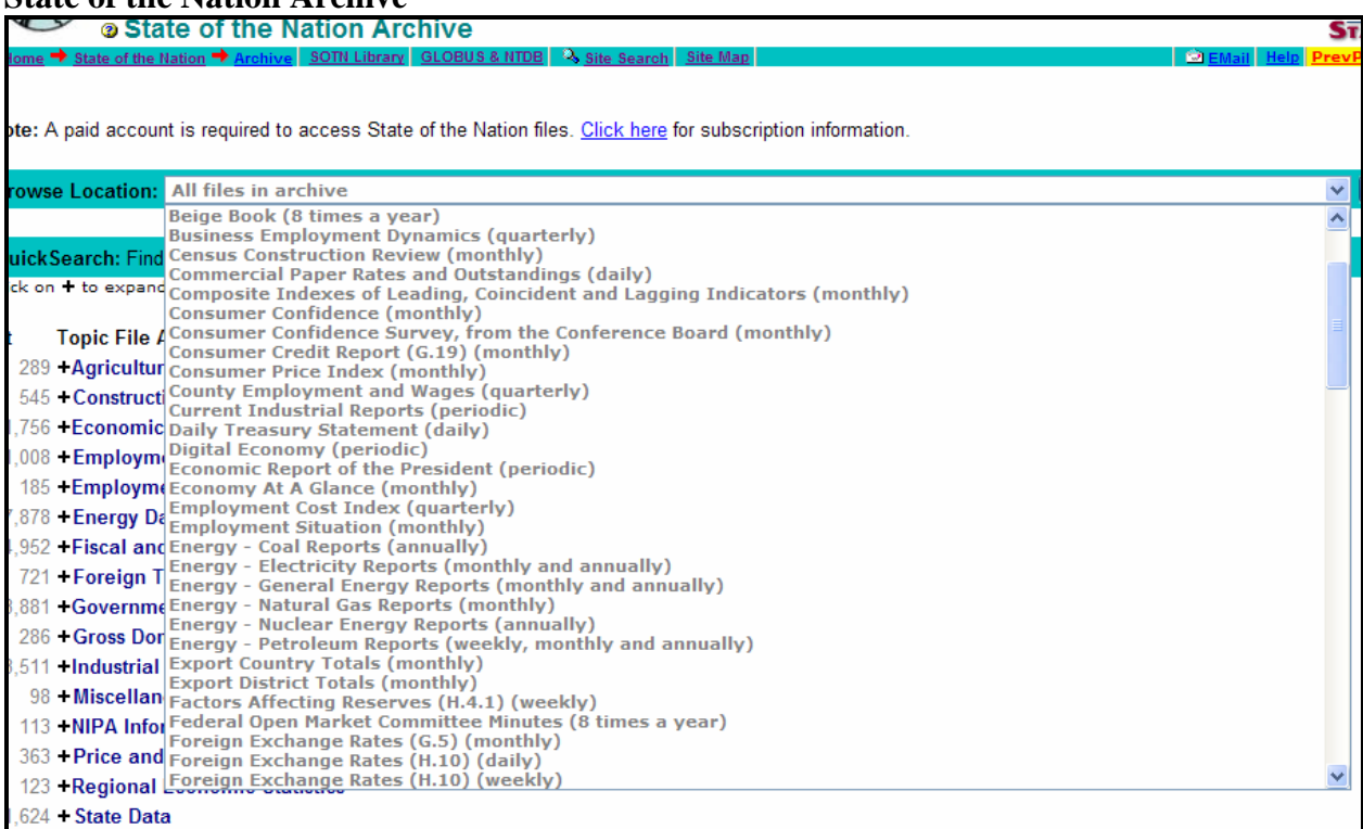
Figure 5.1 State of the Nation Archive

The State of the Nation Archive contains over 44,000 historical files of the statistical releases found in the State of the Nation Library, making it one of the largest databases of historical federal economic information. The reports are categorized by the same headings as in the State of the Nation Library. However, as shown in Figure 5.1 , you may also use the drop-down box to locate specific files by title.