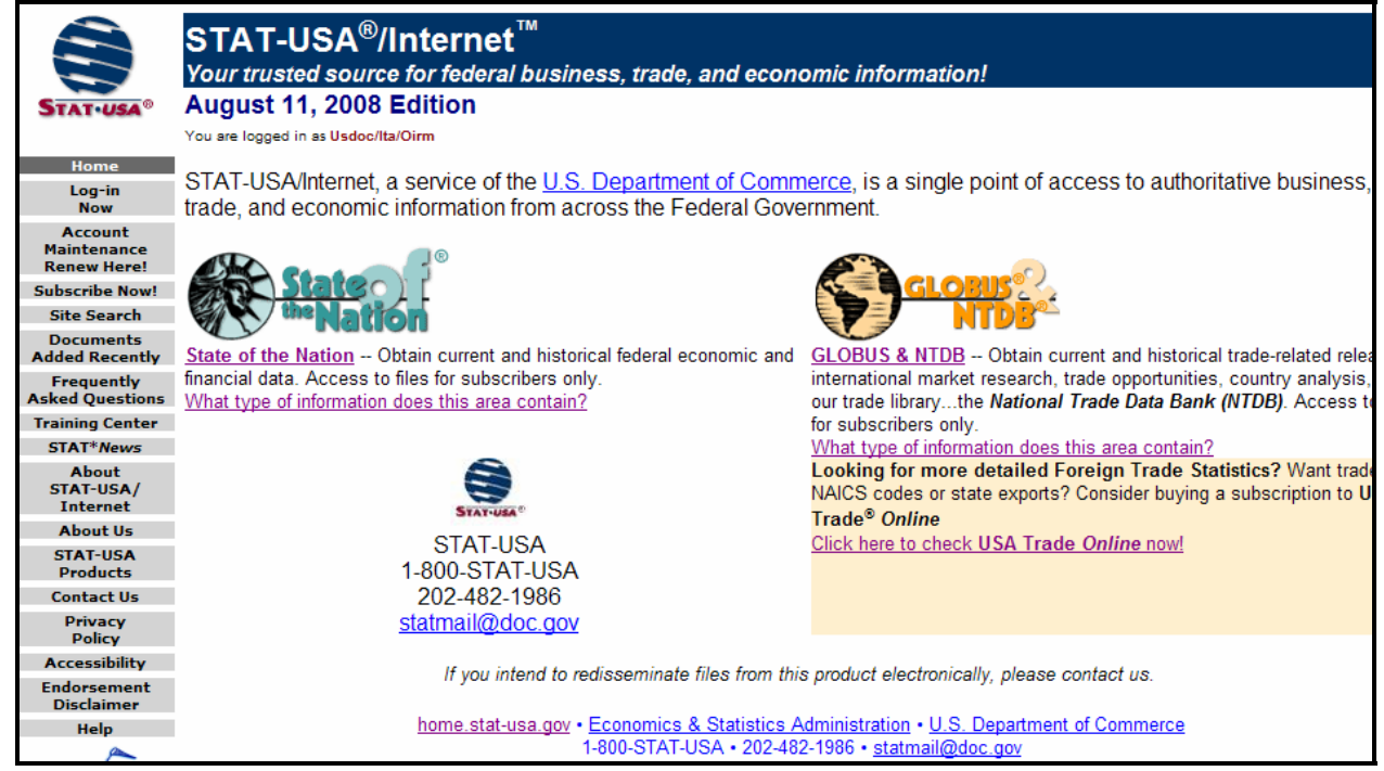
Figure 1: STAT-USA/Internet Home Page

State of the Nation <sup>®</sup> (SOTN): This section tracks the direction of the U.S. economy and provides a repository for statistical releases of economic indicators from a number of federal agencies, including the U.S. Census Bureau, Bureau of Economic Analysis, Bureau of Labor Statistics, Federal Reserve Board, Department of Treasury, and Federal Reserve System banks. Information provided in SOTN includes current and historical economic news/releases, economic indicators, and topical areas including employment and economic policy, and restricted releases. The main SOTN page is located at <a href="http://www.stat-usa.gov/sotn">http://www.stat-usa.gov/sotn</a>.