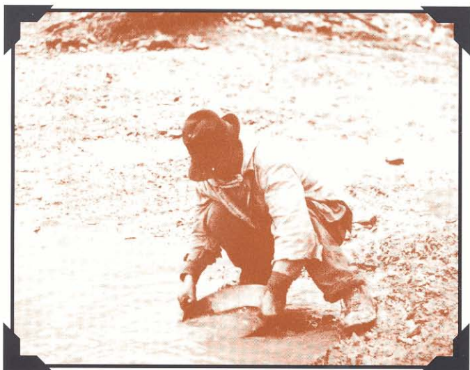
Children at Little Bertha Mine, North Fork circa 1911