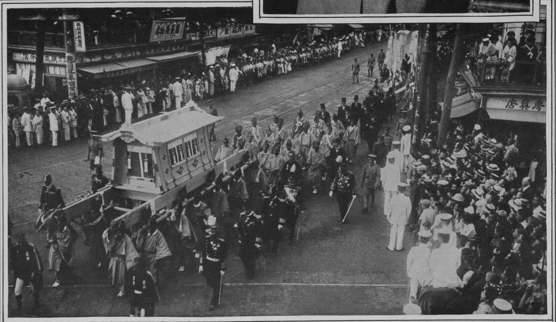
THE FUNERAL PROCESSION OF THE FAMOUS JAPANESE ADMIRAL, MARQUIS INOUE, PASSING THROUGH THE STREETS OF TOKIO.