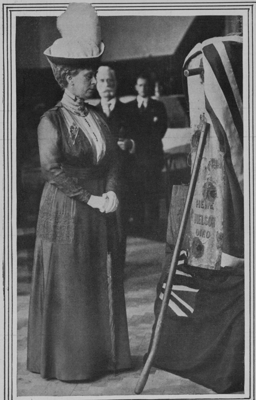
Queen Mary of England Standing Before a Relic of Nelson in the New Building of the British and Foreign Sailors Society at Millwall, Just Opened by Her Majesty.