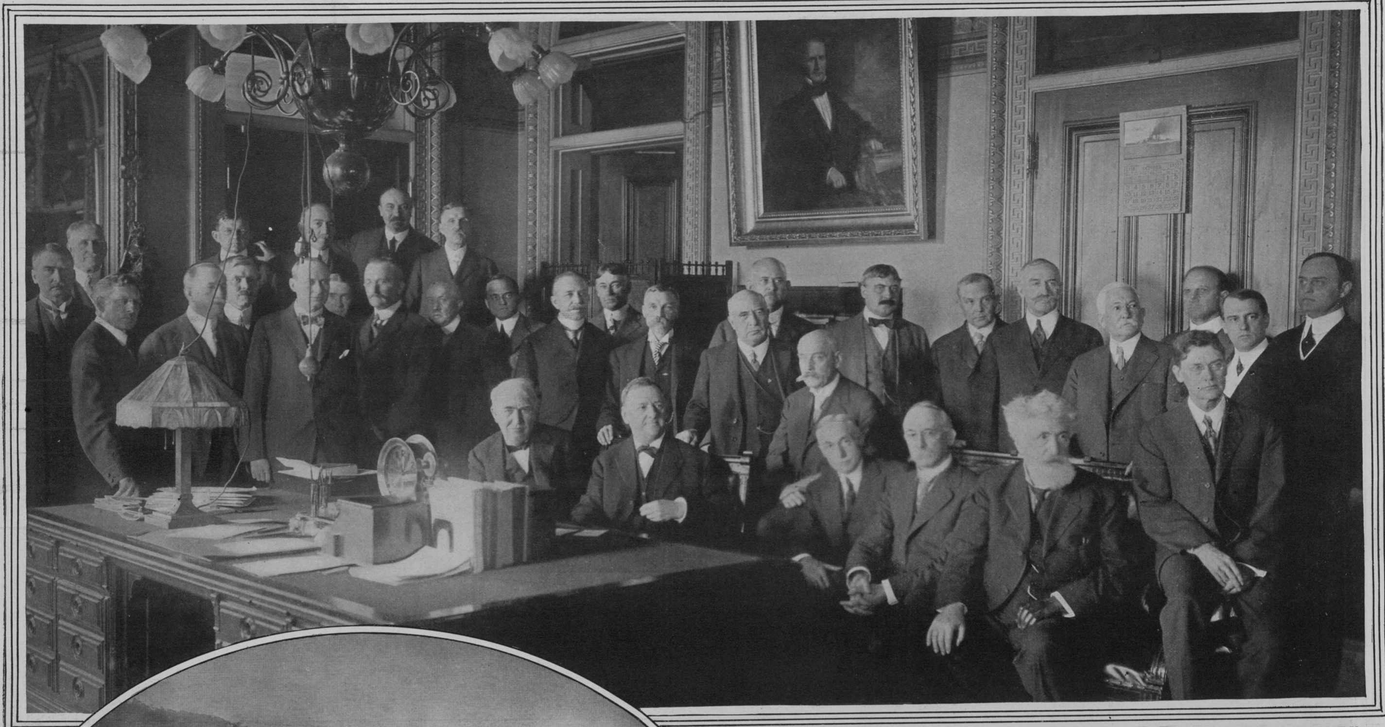
FIRST MEETING OF THE NEW NAVAL ADVISORY BOARD, ASSEMBLED BY SECRETARY DANIELS FROM AMONG THE MOST NOTABLE SCIENTISTS IN THE COUNTRY.