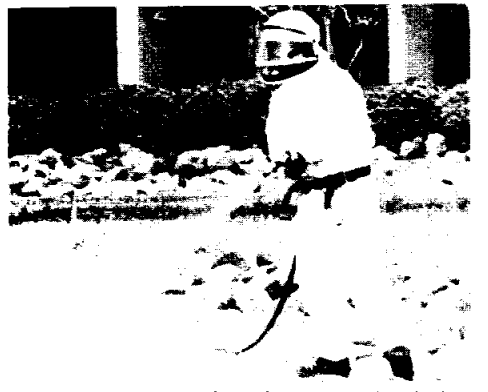
ALIEN ENCOUNTER? - An apparent extraterrestrial operates a mean-looking forceweapon against unseen resistance. Or could it be ...? See page 2 for alien's identity.