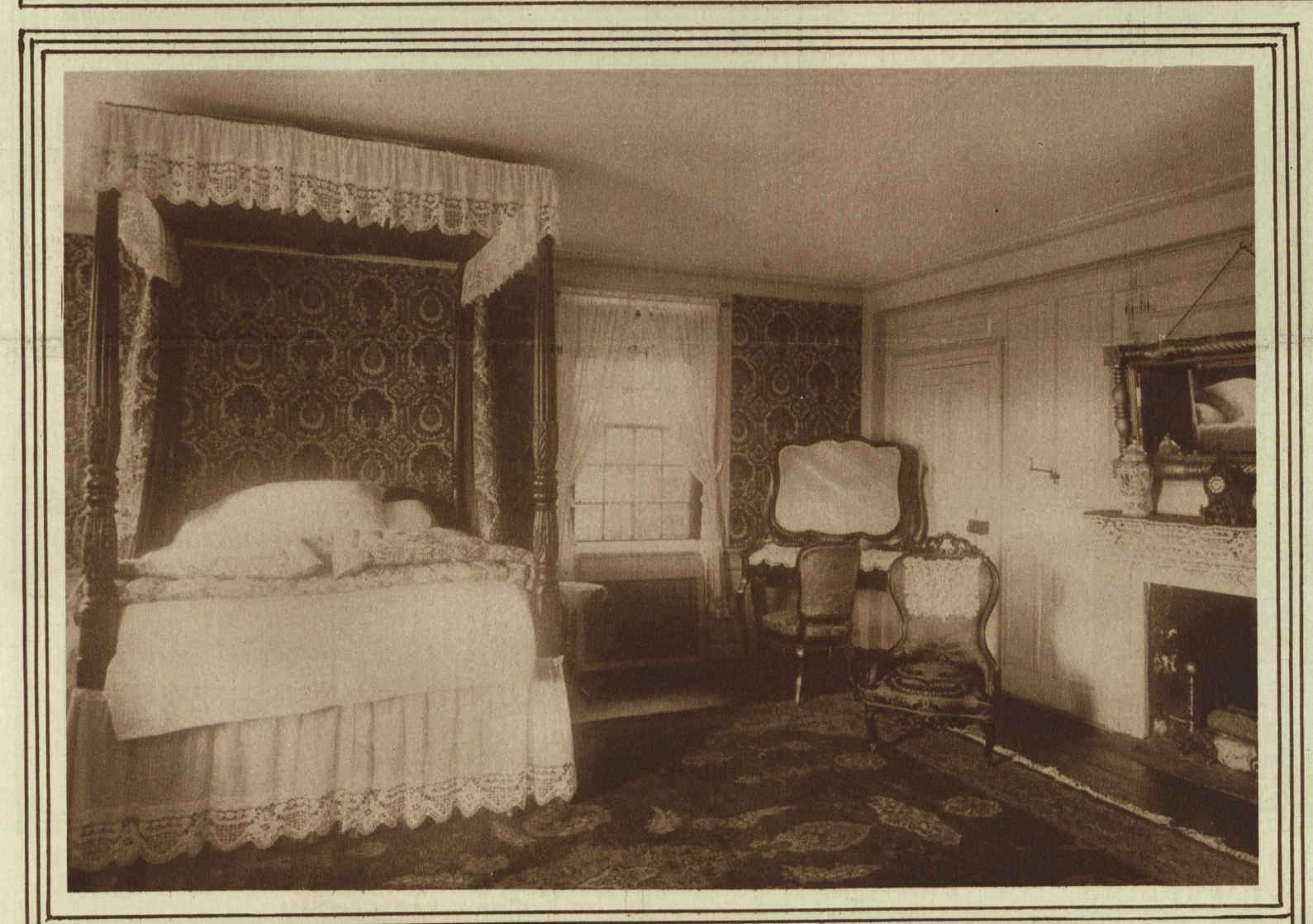
VIEW IN ONE OF THE GUEST ROOMS