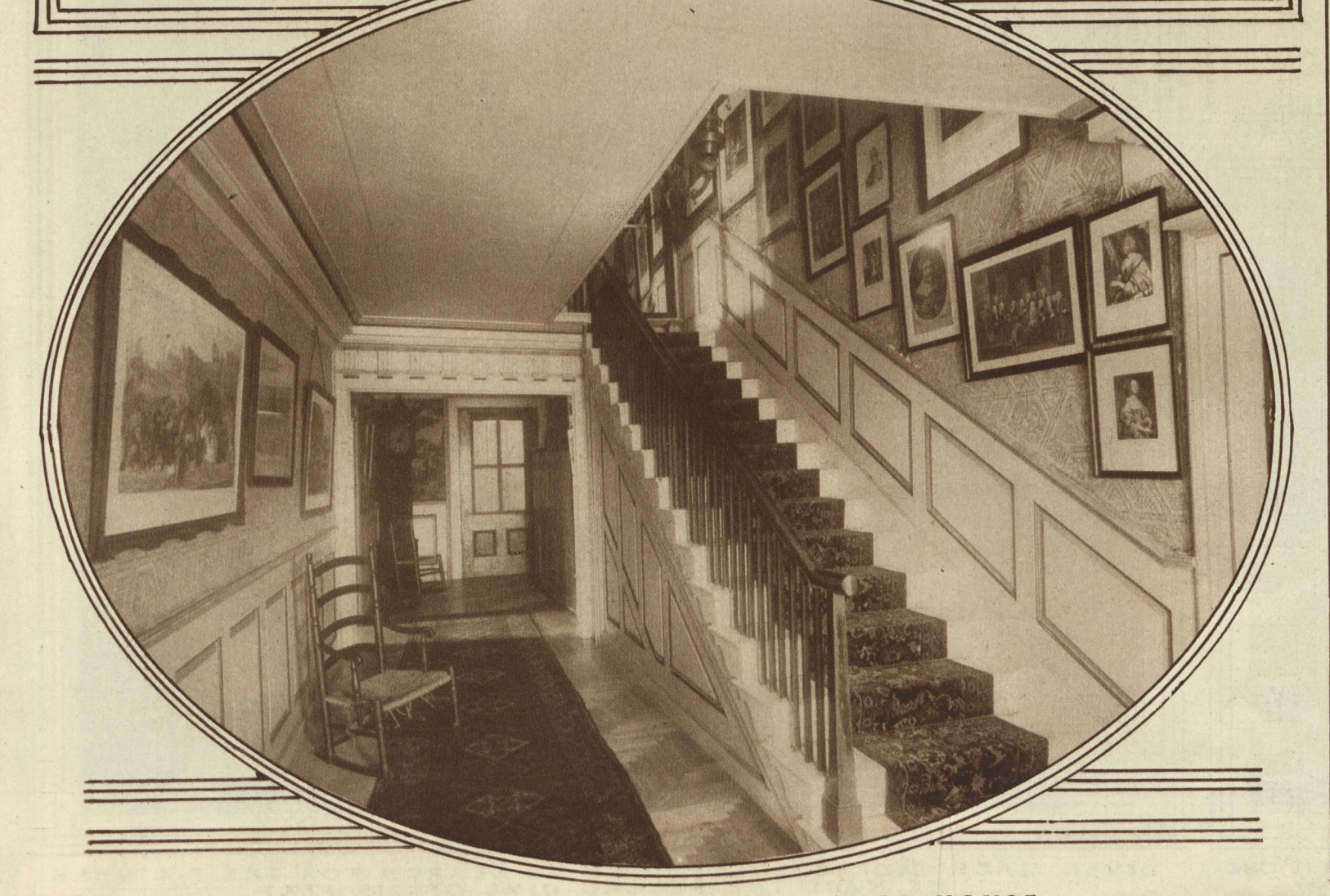
THE ENTRANCE HALL OF THE MANOR HOUSE