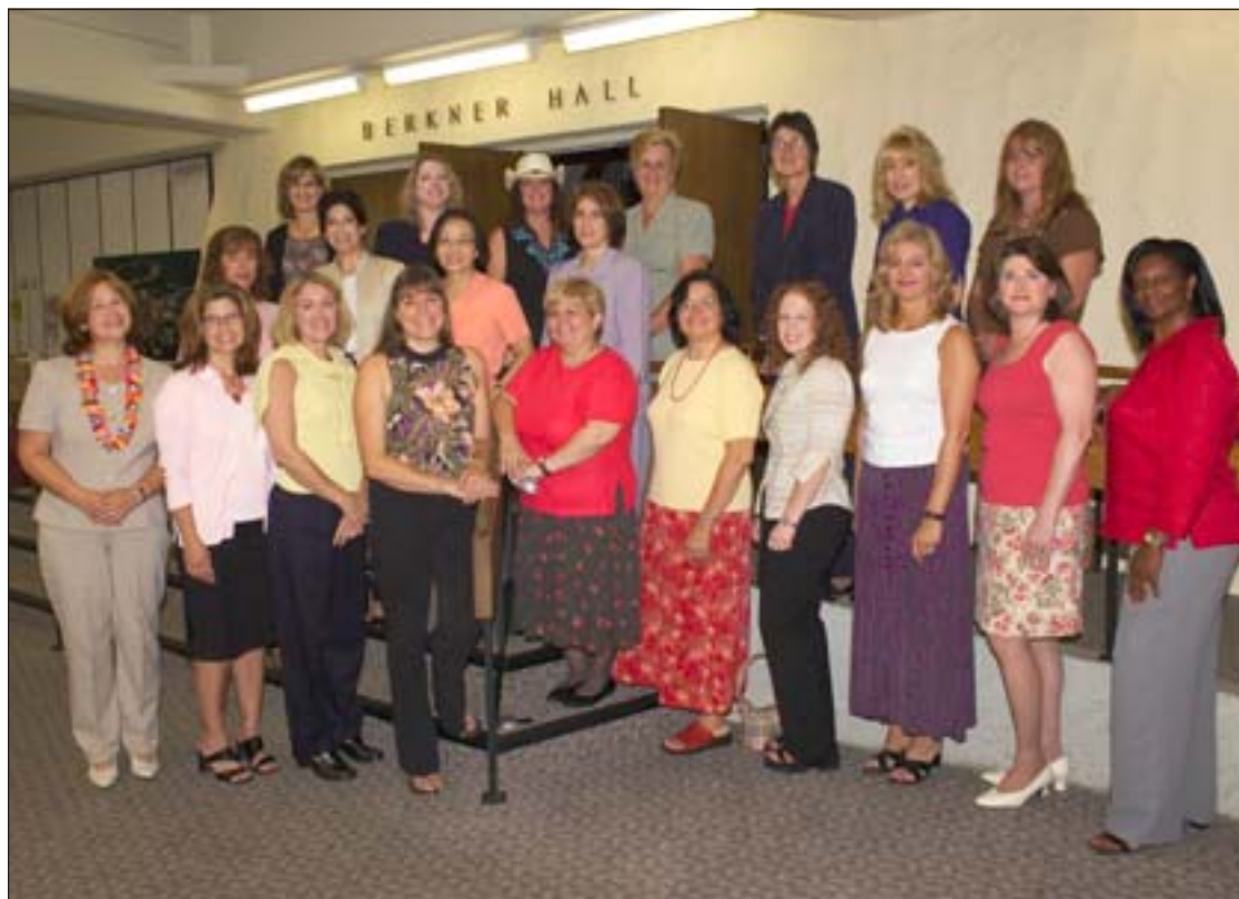
Grouped together in this photo are many of the BNL participants who attended the Federally Employed Women (FEW) National Training Program from Lab Directorates including: Basic Energy Sciences; Energy, Environment & National Security; Environment, Safety, Health & Quality; Facilities & Operations; Finance; High Energy Physics; and Life Sciences; as well as the Diversity Office; the Human Resources & Occupational Medicine Division; the Information Services Division; the Environmental Restoration Division; and the National Synchrotron Light Source Department.