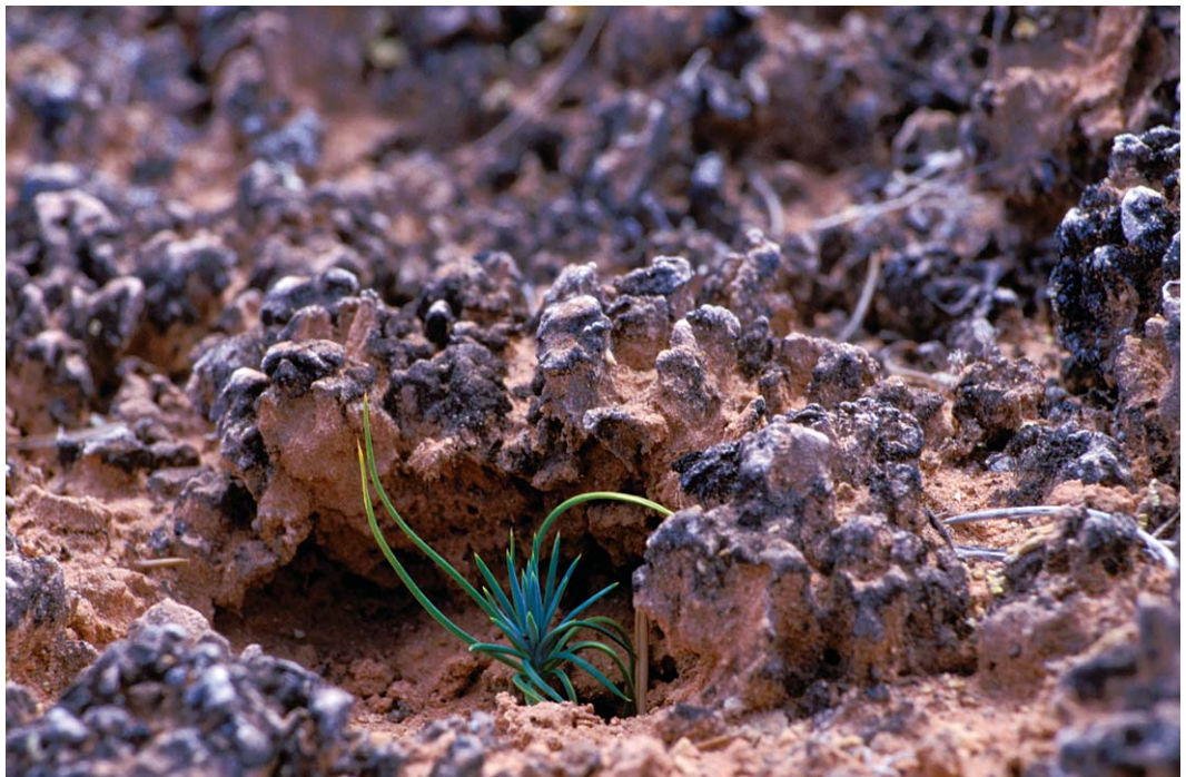
Seedling in cryptobiotic soil crust

A pothole is a unique habitat that is very easily disturbed. Pothole organisms are sensitive to sudden water chemistry changes (brought on by sunscreen, for example), temperature changes, sediment input, being squashed, and being splashed out onto dry land.