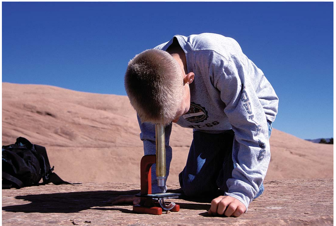
Studying microorganisms through a microscope

4) Preview the field trip, telling students that they will be looking at a couple of different, small communities of organisms, using hand lenses and microscopes to get close-up looks, and completing some scientific experiments. Review the items that students need to bring to school on the day of their field trip.