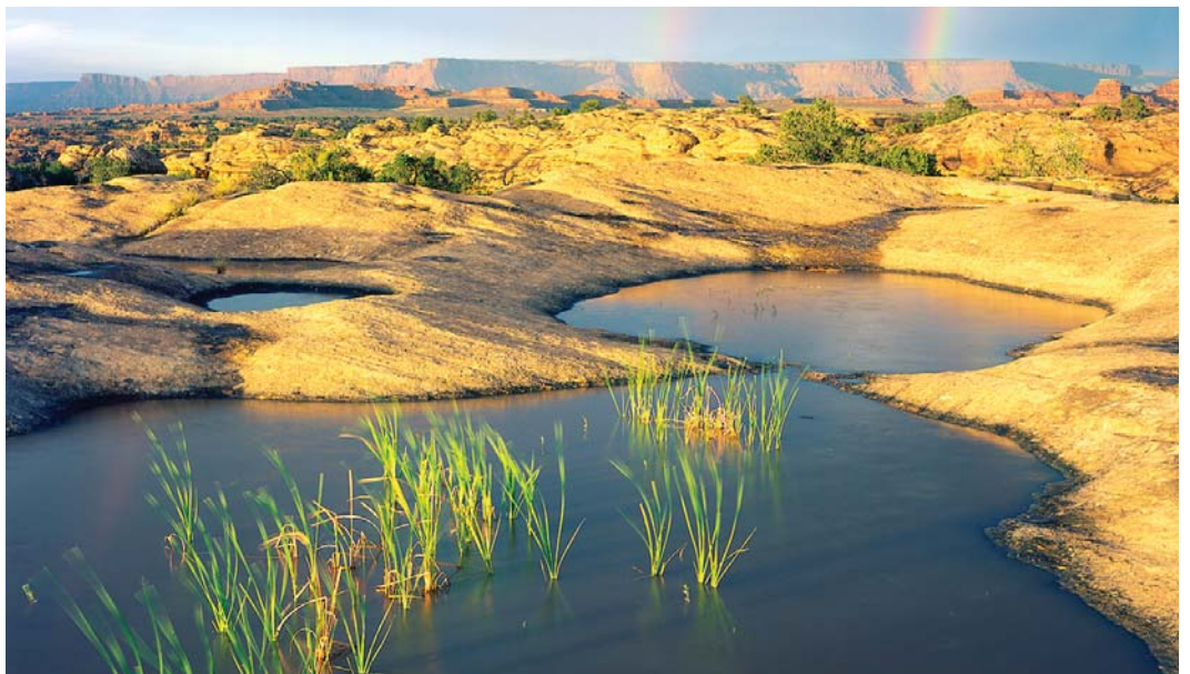
Potholes in the Needles District of Canyonlands National Park