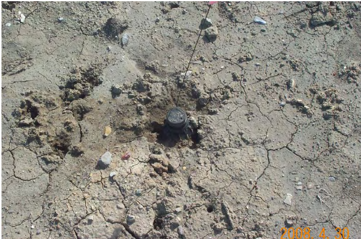
HAL 4/2008. PL-5. Exposed sprinkler head.