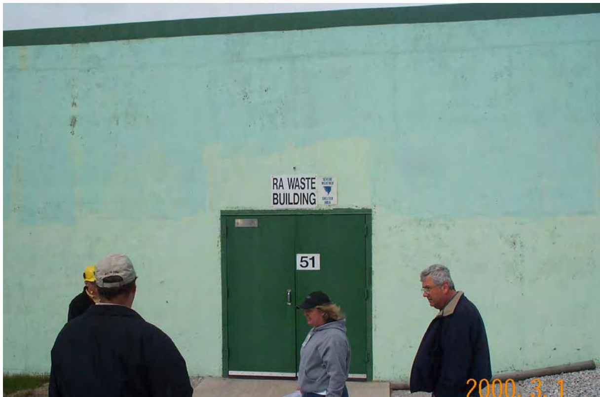
HAL 4/2008. PL-12. Entrance to RA Building.