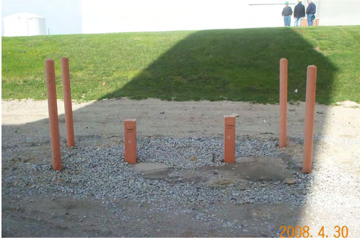
HAL 4/2008. PL-9. Monitor Wells OBS1A and OBS1B.