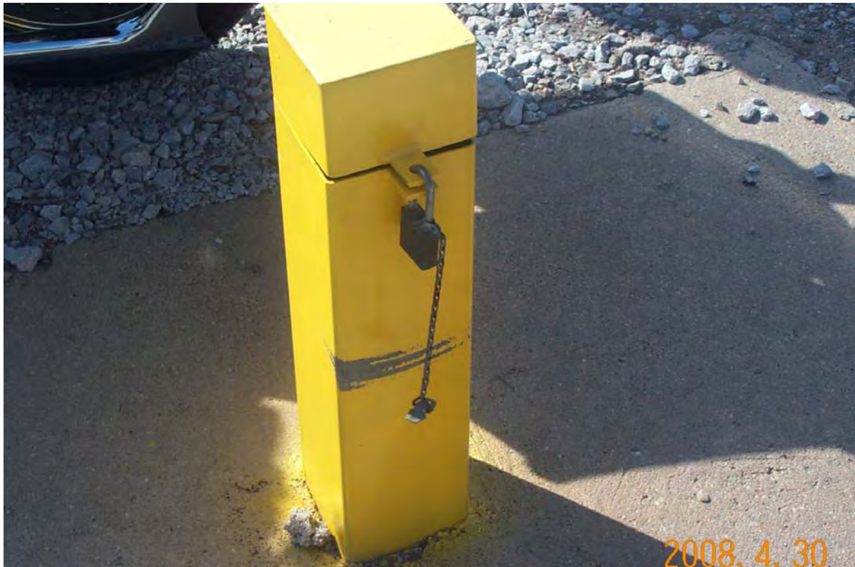
HAL 4/2008. PL-7. Monitor Well OBS-4, free hanging chain on lock.