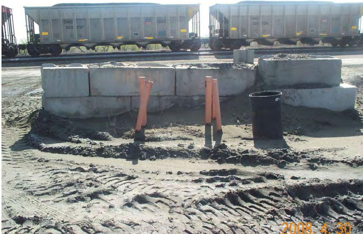
HAL 4/2008. PL-11. Monitor Wells OBS7B and OBS7C.