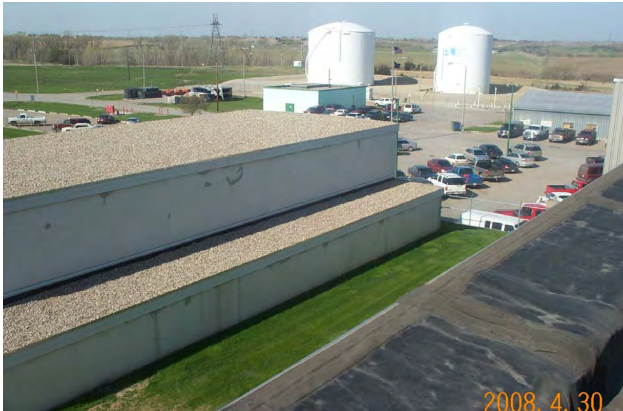
HAL 4/2008. PL-2. Roof of IHX Building.