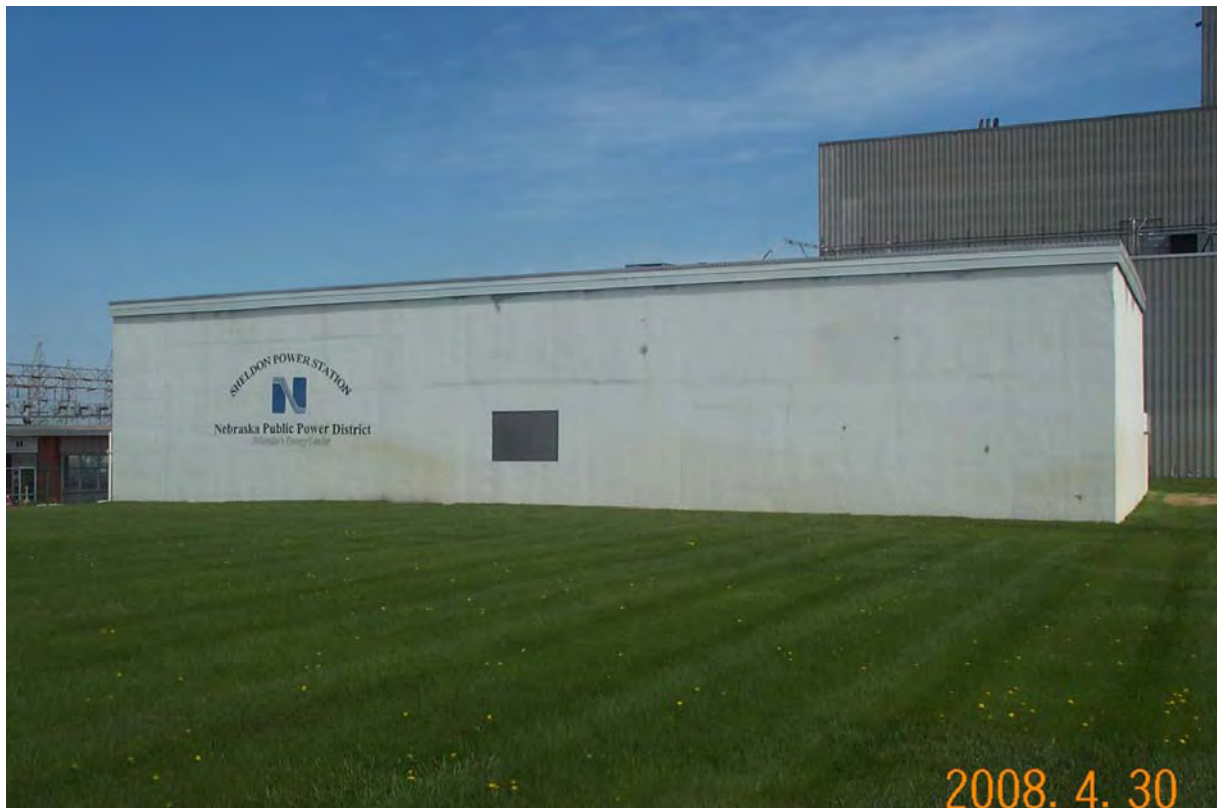
HAL 4/2008. PL-3. South side of IHX Building.