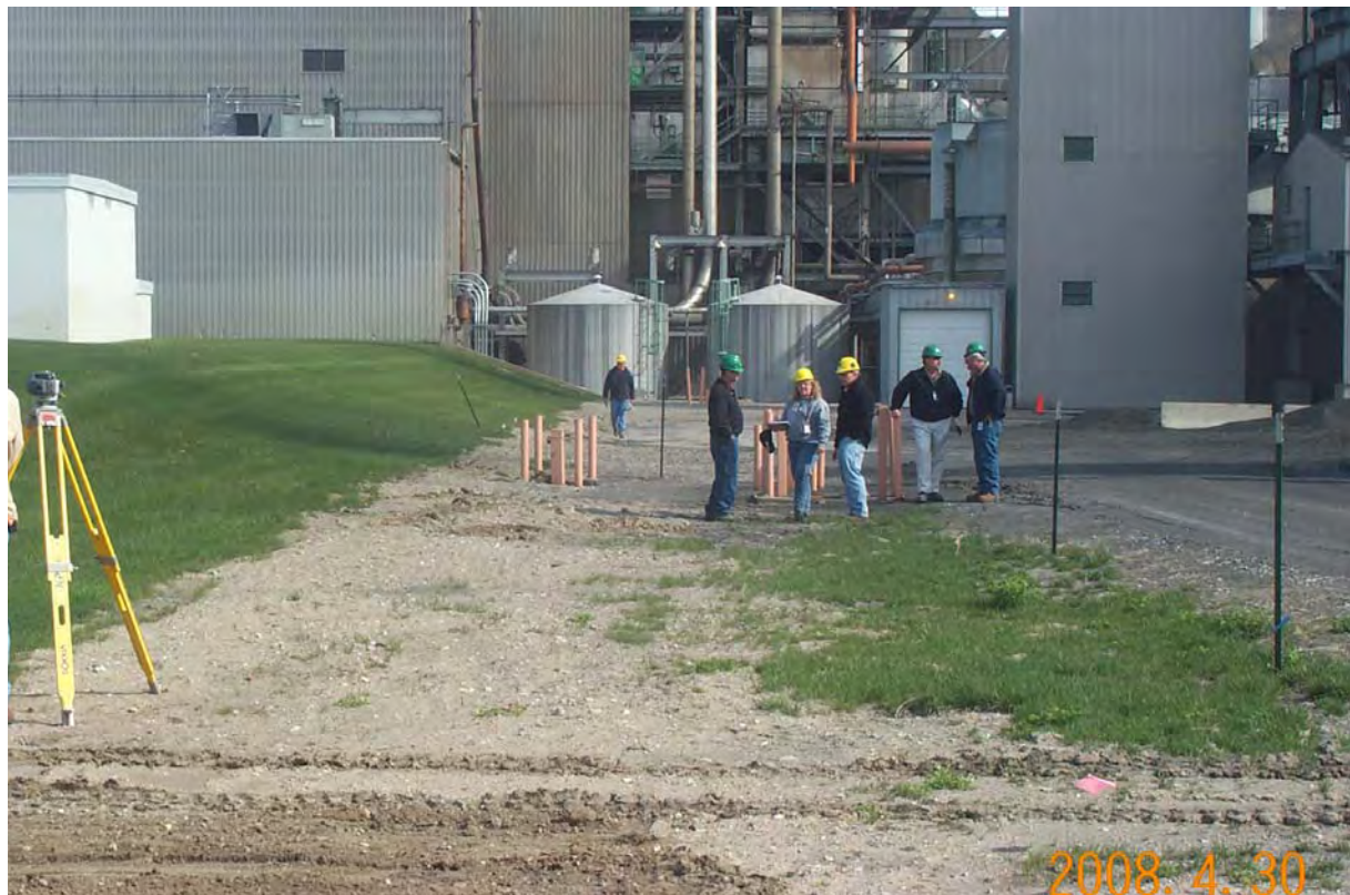
HAL 4/2008. PL-4. Looking north along east side of grass-covered mound.