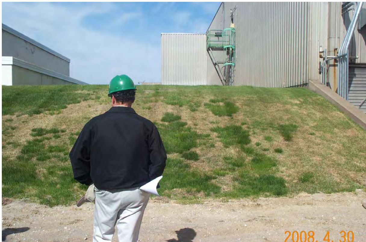
HAL 4/2008. PL-6. Bare grass areas in northeast corner of grass covered mound.