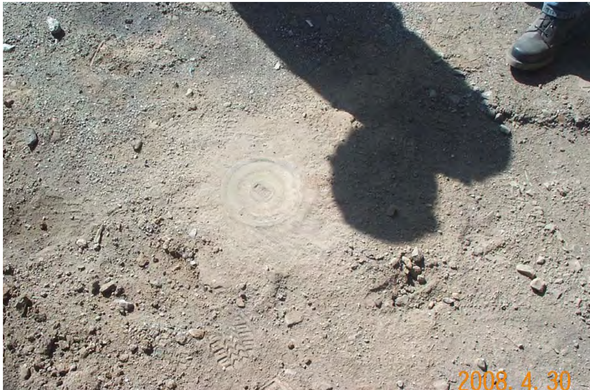
HAL 4/2008. PL-10. Monitor Well at OBS6 location.