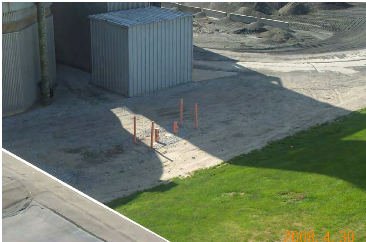
HAL 4/2008. PL-8. Monitor Wells OBS1A and OBS1B.