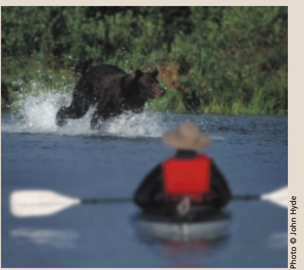
Do not pursue or harass bears for the sake of a close encounter or photograph, either on land or from your watercraft.

While many bears seem to be tolerant of human presence at distances farther than 100 yards, each animal and situation is different. Pay attention to the bear's behavior and respect its right to feed and travel undisturbed. Use telephoto lenses and binoculars. Allow bears to pass by your camp undisturbed. If you have made sure that the bear is aware of your presence so it is not surprised and have kept all your gear under your direct control, allow the bear to pass by unhindered. You may just be afforded the opportunity to safely observe this amazing creature in its natural environment.