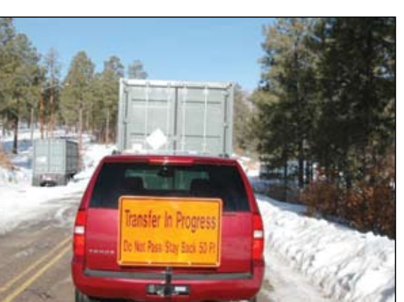
A placard on the back of this vehicle reminds motorists to stay at least 50 feet behind the convoy in this hazardous materials shipment on East Jemez Road.