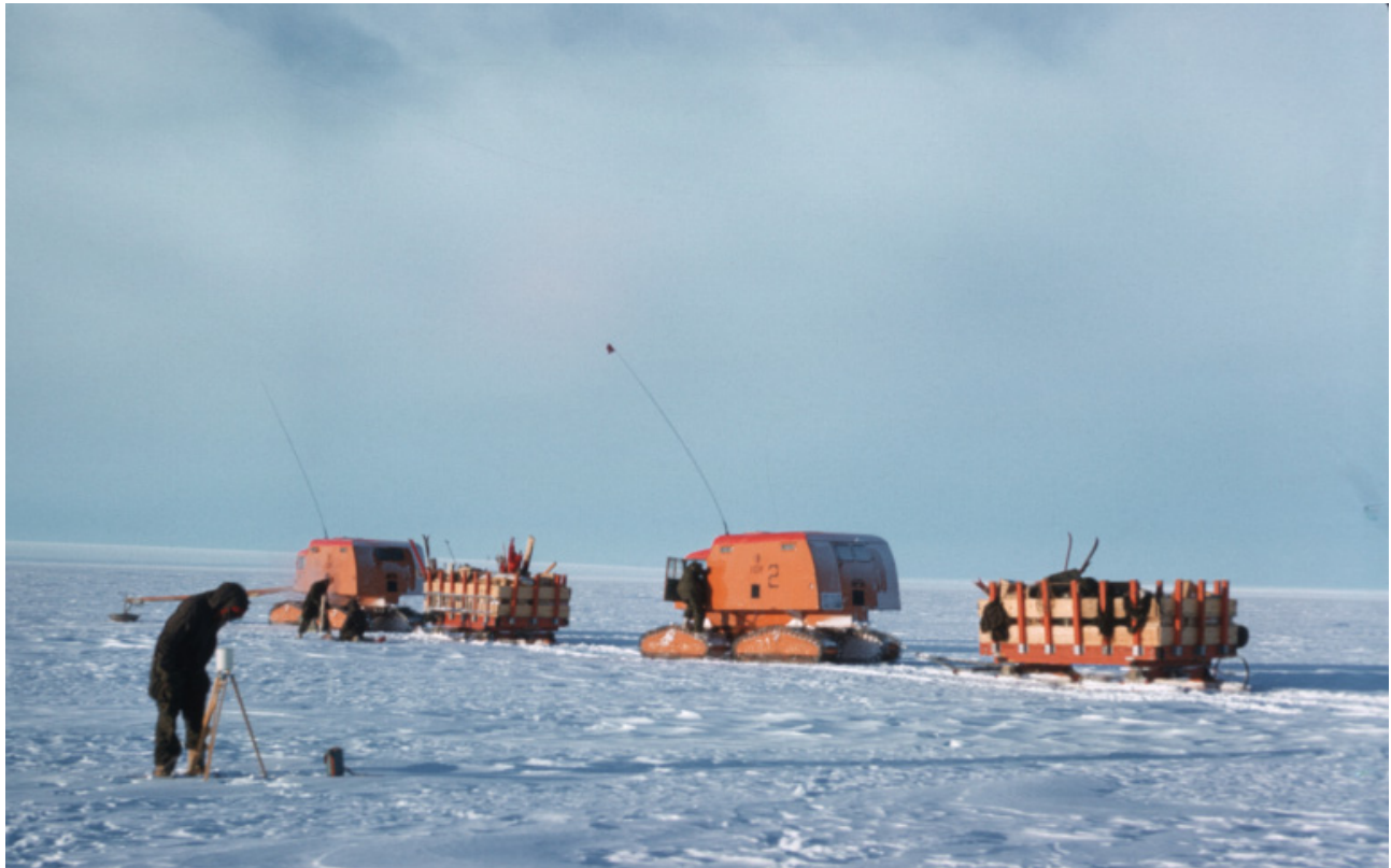
Fig. 1. Traverse at intermediate station. Behrendt reading magnetometer at left. Walker and Aughenbaugh making snow hardness measurement left background. Thiel on track of Sno-Cat after making a gravity measurement. Crevasse detector visible on leading vehicle.

We made gravity and magnetic and altitude measurements every 8 km (Fig. 1) to study the variations in density and magnetic properties of rock beneath the ice, and therefore to make inferences about the ice-covered geology. We also used the gravity data to determine the depth to bedrock between the seismic reflection stations.