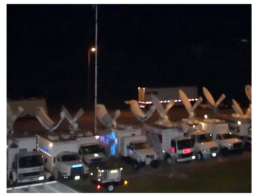
SATELLITE TRUCKS are lined up at the Shuttle Landing Facility for the anticipated early morning landing of Space Shuttle Discovery.