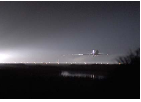
BEFORE A Space Shuttle lands, a Shuttle Training Aircraft (STA) observes flying conditions for the pending landing. This STA approaches the runway at KSC's Shuttle Landing Facility for Return to Flight mission STS-114.