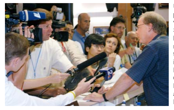
UNABLE TO photograph or video a KSC Shuttle landing, members of the media interview NASA News Chief Bruce Buckingham at the NASA News Center.