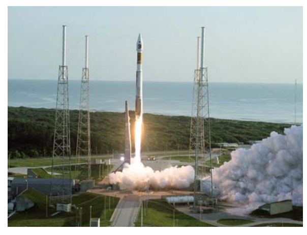
AN ATLAS V launch vehicle with the Mars Reconnaissance Orbiter on top, roars away from Launch Complex 41 at Cape Canaveral Air Force Station at 7:43 a.m. Aug. 12. The spacecraft will intercept the red planet on March 10, 2006.

The Launch Services Program at the Kennedy Space Center is responsible for government