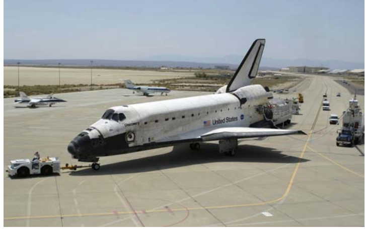
SPACE SHUTTLE Discovery, accompanied by recovery vehicles, is towed up the taxiway at NASA's Dryden Flight Research Center following its Aug. 9 landing.

Touchdown!: The orbiter's main landing gear touches down on the runway at 214 to 226 miles per hour, followed by the nose gear. The drag chute is deployed, and the orbiter coasts to a stop.