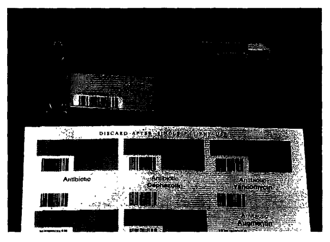
Figure 1. Labels for the system. From top to bottom: prefilled syringe label, ampule flag label, and top of label sheet (comprising generic user-applied labels on left and drug-specific user-applied labels on right). All labels are self-adhesive and colored by class of drug, following an international standard for anesthetic userapplied labels.

All labels (whether applied by manufacturer, pharmacist, or user) have bar codes. When a drug is needed (or an infusion started or its rate changed) the anesthesiologist is expected to read the label and then scan it with the bar-code reader before administering its contents. A laptop computer, attached to the anesthetic machine, is programmed to interpret the bar code, announce the name of the drug (with a prerecorded voice), and redisplay the name on the computer screen in large type along with its color code (Fig. 2). The computer identifies and displays a default dose, which may be accepted or altered by entering