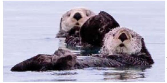
Sea otters in Kachemak Bay, Alaska

offal may attract sea otters to an area. Untreated sewage dumped in the nearshore marine environment can transmit terrestrial disease. An example is Toxoplasma gondii , from cat feces, which affects the central nervous system.