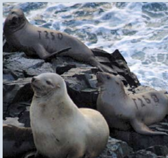
Steller sea lions, branded on Marmot Island, Alaska