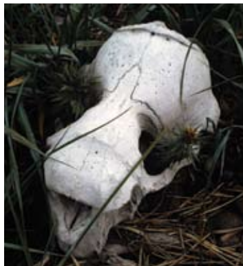
Walrus skull on St. Lawrence Island, Alaska

Likewise, federal law prohibits collecting any part of any animal on the endangered species list, which includes Steller sea lions and most whales.