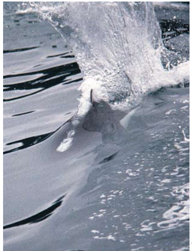
Dall's porpoise bow riding

A separate set of regulations pertains to collecting bones, baleen, skulls, skins, and feathers. See page 7 in this issue, “Collecting.”