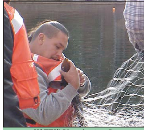
Biologists from the tribe and other cooperating agencies assessed the lake sturgeon population and determined it had recovered enough to allow a fishing season.