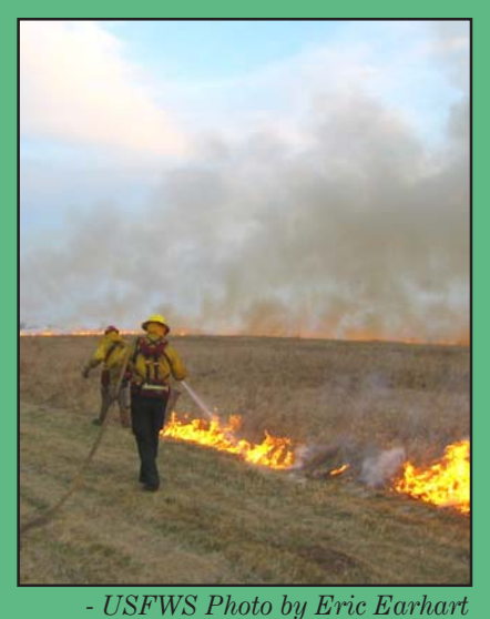
One of several prescribed fires on private lands completed near Windom WMD with the assistance from the Service.