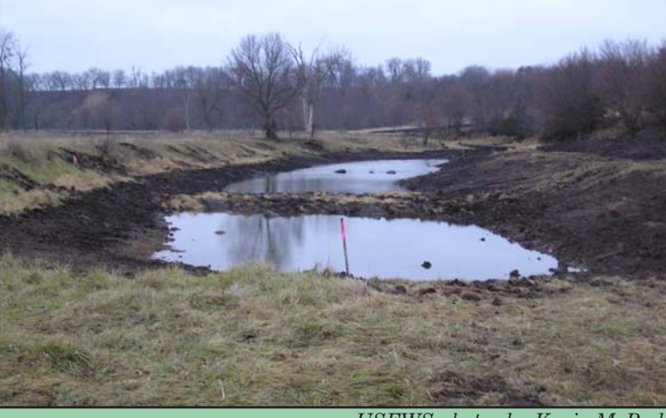
- USFWS photos by Kraig McPeek

The project site before (top) and after (bottom) construction. Small pothole wetlands can provide seasonal or permanent habitat for Topeka shiners and many other fish, reptiles, amphibians and birds.