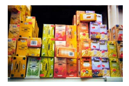
Exhibit 5: Dalgety Tea at a local ethnic store;

obtaining a significant market for his tea during the past 7 years. Dalgety brand tea has recently found its way into the four major super market chains in the UK – Sansbury, Tesco, Safeway, and Waitrose, and has recently signed contracts with distributors in the US and Ireland. He is currently researching introducing his product, much of which contains Guyanese grown Cerrassee tea leaves, into the continental European market and has begun to distribute a line of Plantain chips.