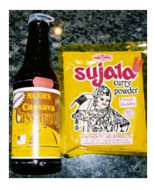
Exhibit 8: Examples of Guyanese products on the market.

speech where he discusses this project and organic production in general). This project should be looked at as an opportunity for gaining a foothold in the London market for organic products. In order to attain a piece of this market the Guyanese producers will most likely require advisory services to further investigate and pursue regulatory