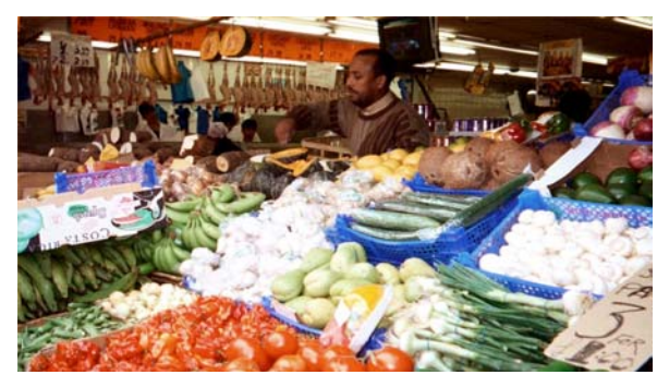
Exhibit 7: Produce stand, Brixton Market with Scotch Bonnet and Casava among other produce.

Herbs and Spices. A few importers of herbs and spices were interviewed for this study. In all cases the importers said that the demand for Caribbean herbs and spices is increasing due to the increase in spices and the decrease in Asian supply. However, the importers who had attempted to import herbs from Guyana were disappointed in their