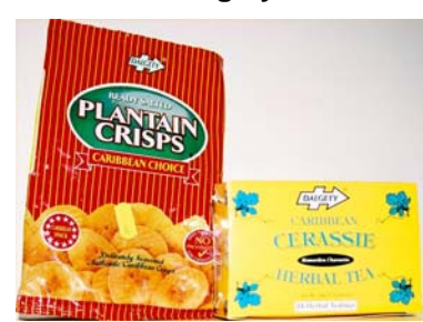
Exhibit 4: Dalgety Products

New York, it is also an older market with several second and third generation Guyanese who, it is presumed, seek out Guyanese specific products to a lesser extent than recently arrived immigrants. Furthermore, the population is more dispersed then that of the New York and Toronto markets. As a result, many labels promote their products as "Caribbean". Although most products do list their country of origin, more general Caribbean logos are used in the UK markets. For example: