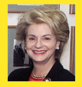
Ambassador Penne Percy Korth Texas

The U.S. Advisory Commission on Public Diplomacy is a bipartisan panel created by Congress and appointed by the President to provide oversight of U.S. government activities intended to understand, inform, and influence foreign publics.